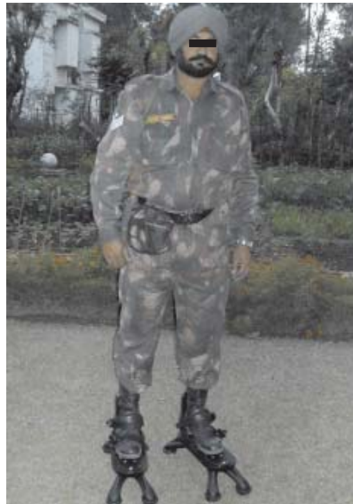
Fig. 1 : The Spider Boot

The protection afforded to feet and legs depends on the explosive content and the relative location of the mine. The Spider Mine Boot Protection System prevents