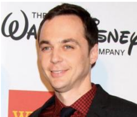
17 Gay Actors Who Rock at Playing Straight Characters?