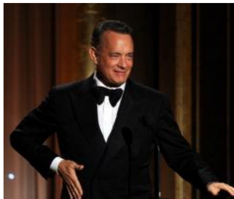
Top 10 Films Starring Legend Tom Hanks