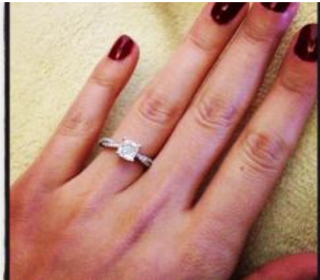
A Guy's Engagement Ring Buying Guide