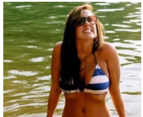
Best Pick Up Lines of All Time