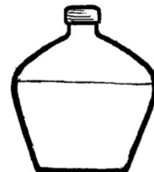
Narrow mouthed containers are safest for storing water.