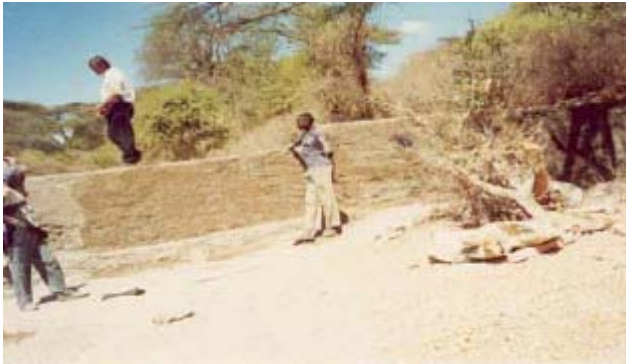
Figure 3: Sectional view of sand dam