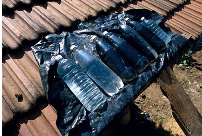
Figure 2: Bottles are left for the day.

SODIS is a simple, low-cost and easily replicable solution to clean drinking water. SODIS works through a combination of heat and pathogen-killing Ultra Violet radiation (both through sunlight). For this method to work well, the exposure to sunlight should be at least six hours, or until the water reaches a temperature of 55°C.