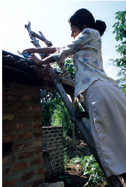
Figure 1: Placing plastic bottles on the roof to expose them to the sun, Sri Lanka.

Simple, hygiene practices in everyday life can have a huge impact on the public health condition in developing countries. It has been found that hand washing (with soap, ash or other cleaning agent) alone can reduce diarrhoeal disease transmission by one third. Hand washing, combined with safe disposal of human waste (faecal matter) and careful storage and handling of water can have great benefit towards reducing water-borne infections. Treating water to improve its quality should be combined with these health-promoting practices to make a lasting change in the public health of people in developing countries such as Sri Lanka.