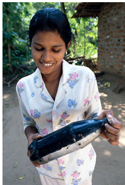
Figure 3: The back face of the bottle can be painted black to help absorb solar energy thus heating the water.