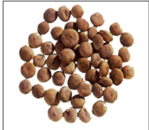
Dried clearing nuts