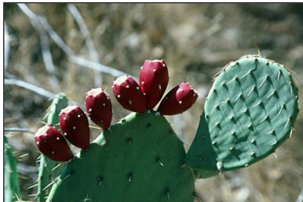
Prickly pear cactus