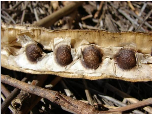
Moringa seeds in a pod

Users add the prepared dose of coagulant to the water. The water is then stirred for a few minutes to help create flocs. The flocs can be settled out and the clear water is decanted, or removed by filtration.