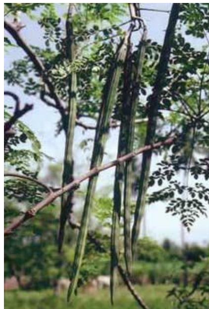
A. de Saint-Sauveur

Bacteria and viruses can attach themselves to the suspended particles in water that cause turbidity. Therefore, reducing turbidity levels through coagulation may also improve the microbiological quality of water.