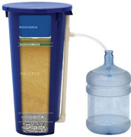
Cross Section of Plastic Biosand Filter