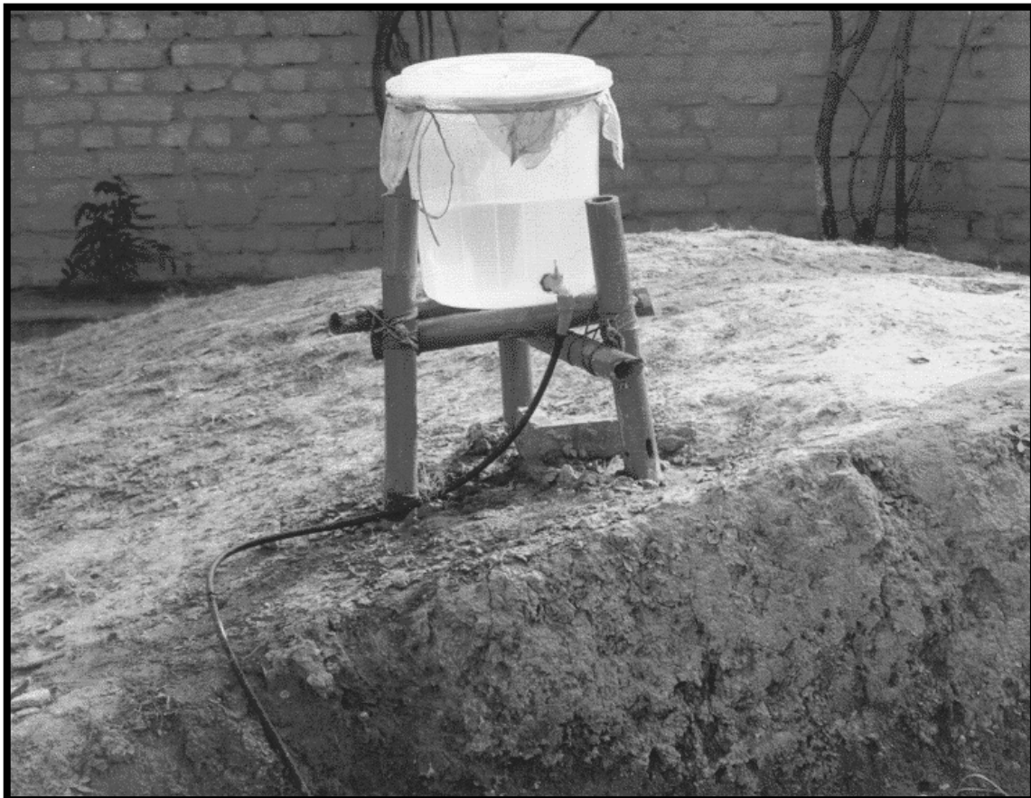
The bucket kit for low cost drip irrigation in the test laboratory of IDE India near New Delhi. A simple product with a long trial and error phase to make it suited to the needs of poor horticulturists.