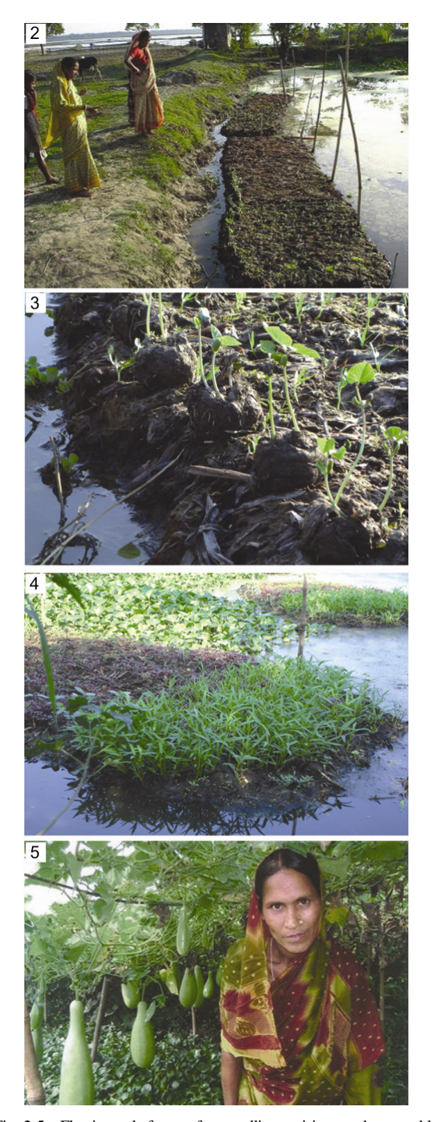
Figs.2-5—Floating platforms for seedling raising and vegetable cultivation, 3 Bean seedlings in ball-like structures made of rotten water hyacinth are raised on a floating garden, 4 Vegetables grown on floating gardens, 5 Bottle gourd seedlings raised on floating gardens in monsoon gave rise to healthy plants with good yield in early winter.

at the household level, and upheld potential nutritional security of the haor people all-the-year-round.