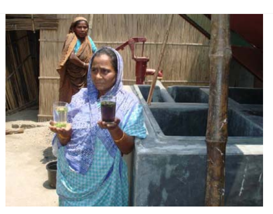
Figure 5: Arsenic removal monitoring with guava leaves.