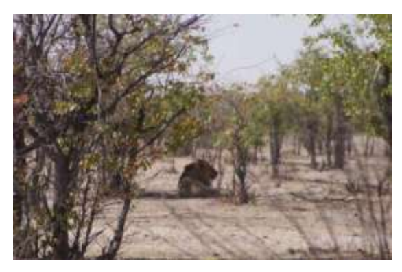
Mopane trees providing shadow to a lion.

Forest to Settlement: 26 ha/year, 591 tonnes CO<sub>2</sub>/year