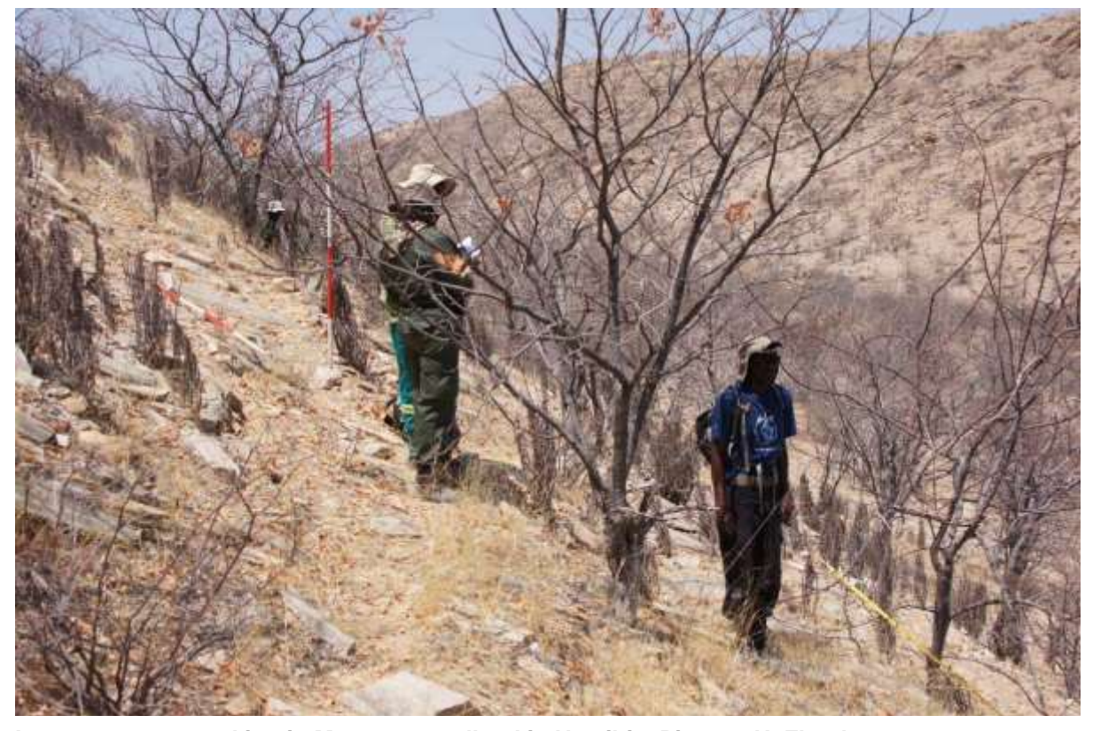
Inventory team working in Mopane woodland in Namibia.

forest appeared larger on images from 2010 (14,392 km<sup>2</sup>) than on images from 2000 (12,042 km<sup>2</sup>) that showed more degraded areas than images from 1990 (7,894 km<sup>2</sup>). Nevertheless, the rate of degradation slowed down in the second decade. In relationship to the area of intact forest land in 1990, the annual gross degradation rate was 3,13% during the first decade and rose marginally to 3,43% in the second decade. Degradation has a substantially greater impact on the forest at the test site than deforestation, which calls for further investigation into the drivers of degradation.