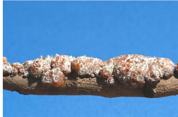
Lac tubes created by Kerria Lacca

Shellac is scraped from the bark of the trees where the female lac bug, Kerria lacca (Order Hemiptera, Family Kerriidae), also known as Laccifer lacca , secretes it to form a tunnel-like tube as it traverses the branches of the