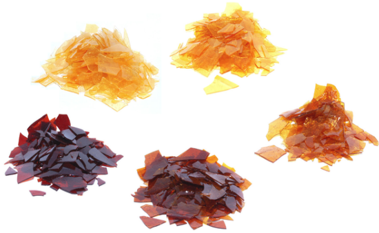
Some of the many different colors of shellac

Shellac is a resin secreted by the female lac bug, on