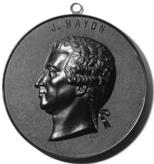
A decorative medal made in France in early 20th century moulded from shellac compound, the same used for phonograph records of the period.

Upon mild hydrolysis shellac gives a complex mix of aliphatic and alicyclic hydroxy acids and their polymers that varies in exact composition depending upon the source of the shellac and the season of collection. The major component of the aliphatic component is aleuritic acid, whereas the main alicyclic component is shellolic acid. [10]