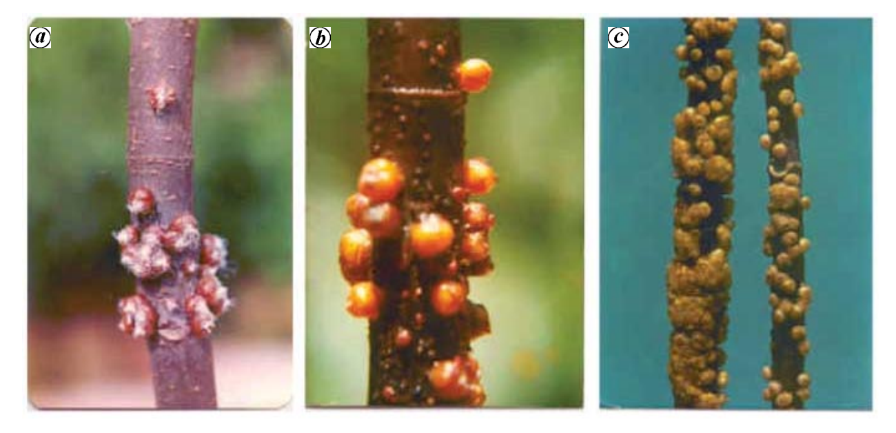
Figure 1. a, Crimson lac insect: body colour crimson, resin colour yellowish orange. b, Yellow lac insect: body colour changes to yellow, resin colour remains yellowish orange. c, Cream lac insect: both body as well as resin colour are creamish.

tion of bi-voltine life cycle and non preference of kusum , as a host, whereas kusmi strain by a more or less equidurational life cycle and preferring kusum as a host. Quality of resin produced by kusmi lac insect is superior in comparison to rangeeni lac insect. Significant quantitative and qualitative variation in various biological attributes of the lac insect, viz. yield of resin, fecundity, sex ratio and body colour have also been reported<sup>10–14</sup>. The pigment present in the lac insect haemolymph (laccaic acid or lac dye) is non-toxic and finds numerous applications in textile, pharmaceutical and food industry. Qualitative and quantitative variations in lac insect dye have been observed showing crimson, yellow, albino and cream body colour (Figure 1 a – c ).