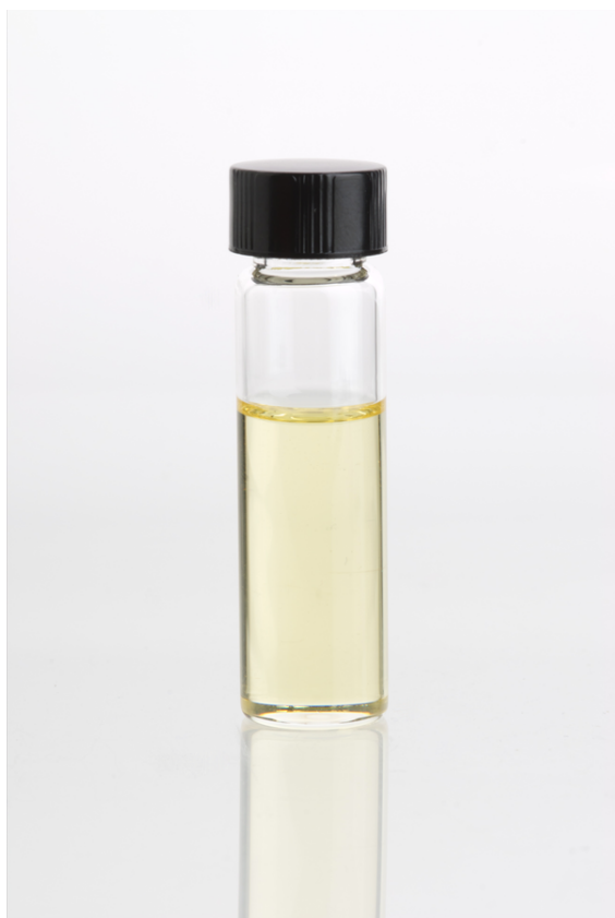
Elemi (Canarium luzonicum) essential oil in clear glass vial

Elemi resin is a pale yellow substance, of honey-like consistency. Aromatic elemi oil is steam distilled from the resin. It is a fragrant resin with a sharp pine and lemon-like scent. One of the resin components is called amyrin.