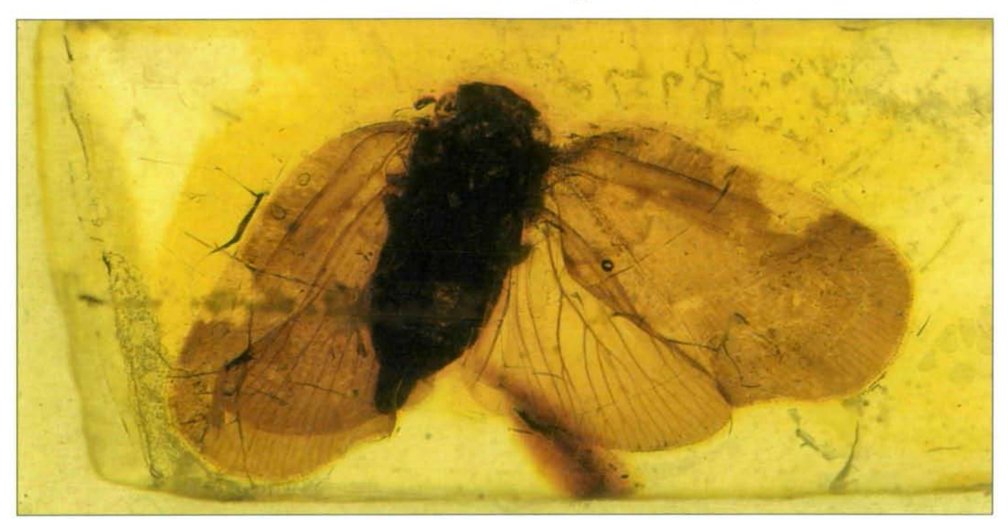
Fig. 1: Acroprivesa msandarusi sp. nov.

Etymology. Species name from the Suahili word 'msandarusi' – gum copal tree (Hymenaea verrucosa).