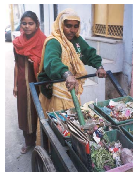
Photo 1: Door-to-door solid waste collector in Delhi

Waste is generated by a range of stakeholders including: pedestrians, households, businesses, markets, industries and healthcare facilities. Therefore solid waste can also include toxic waste (e.g. chemicals from industry), biological waste (e.g. dressings from hospitals) and occasionally faeces (e.g. from nappies). These hazardous wastes require specialised treatment and disposal, not discussed in this technical brief. The source of waste often determines its quantities and characteristics. In developing countries waste generated from various sources is often combined at collection and disposal, so due care must always be taken to ensure the health and safety of those involved in waste management.