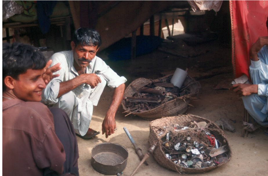
Photo 2: Recyclable materials dealer in Pakistan.

Many cities have active recycling sectors. This is predominantly an informal-sector activity, and can provide employment for tens of thousands of urban poor in a single city (photograph 2). Where the sector is particularly well developed, influential businessmen may have vested interests in retaining control. Efforts of SWM planners may be best directed at regulation and support: for example ensuring recycling workers are properly protected from health and safety risks, and that businesses access recyclable materials as close to the point of generation as possible (e.g. collected from households, not picked from a disposal site).