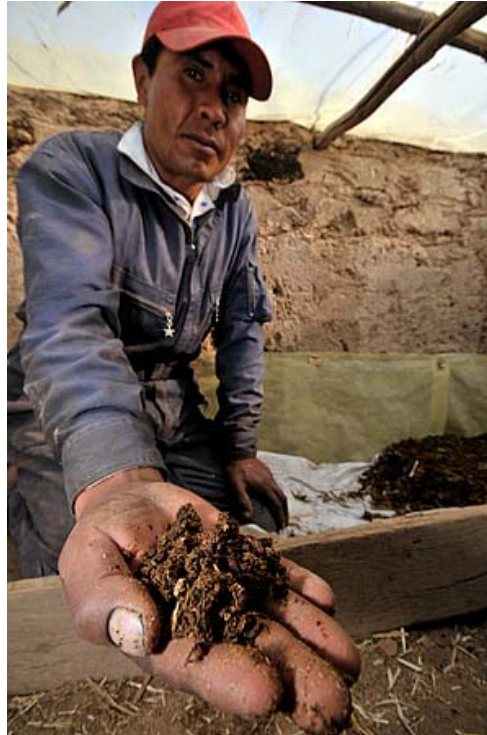
Figure 1: Composting in Colquencha, Bolivia.

Unlike other components of household waste such as metals, glass and paper, organic waste is considered low-value and is rarely collected from recycling or processing by the informal sector or businesses. This can be explained by its density (it is composed predominantly of water), the cost and difficulty of transportation, the land required for processing, and the relatively low-value of resultant products.