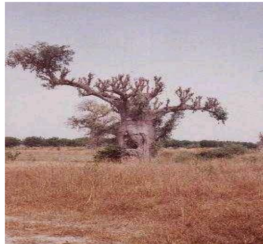
A goat browsing a tree (left). The area is degraded, and there is sparse groundcover. Multiple-use trees such as Baobab (right) may be the panacea to this kind of degradation.