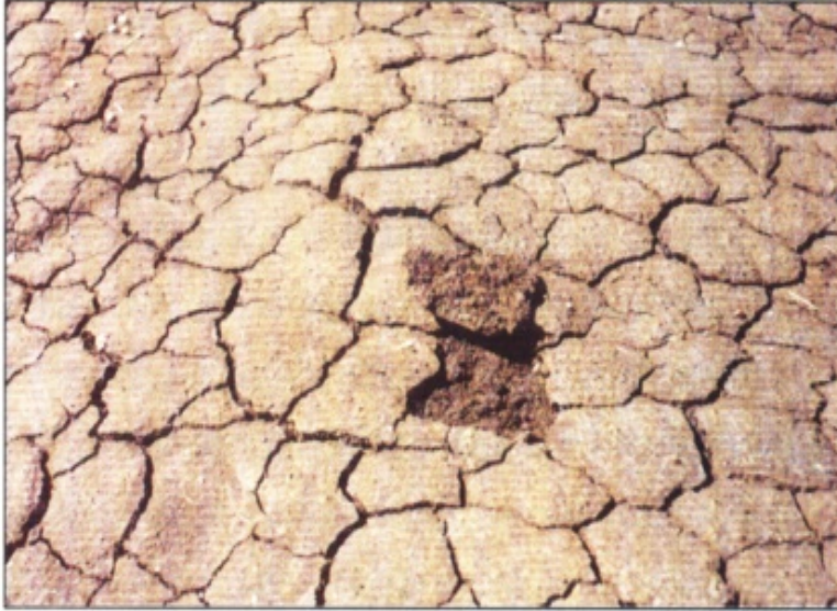
Soil crusting is a common feature in the drylands of eastern Africa.

One of the key problems facing eastern Africa drylands is soil erosion. Soil, for all practical purposes, is a non-renewable resource. The processes of soil formation take eons and ages, but the rate of soil degradation in the drylands is phenomenal. Billions of tons of topsoil are lost annually. In Ethiopia, for instance, an estimated 1 billion tonnes of valuable topsoil is lost annually. This massive problem is coupled with the exploitation of woodland resources and invasion by colonizing weed species such as Prosopis juliflora . As a result of these (and other) problems, the phenomenon of ‘dust bowls’ has become a common occurrence in EA drylands.