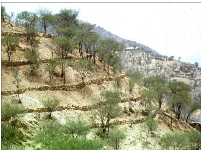
Rehabilitating a degraded hill-slope in Ethiopia: farmer innovations need to be integrated into land rehabilitation initiatives.

In areas with low rainfall (between 150–300 mm), legume crops are grown in association with Acacia senegal . CAZRI has developed gum arabic exudation techniques (Khan and Harsh 1994) which, when adopted by tappers, double the incomes they realize from traditional systems of gum exudation (Harsh et al. 2000).