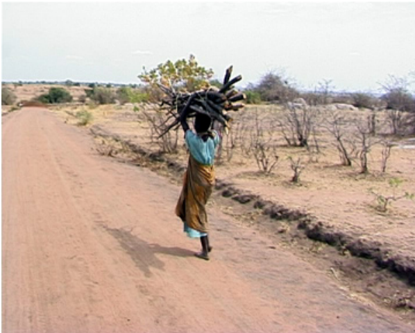
Seeking the all-important fuelwood: an increasing human population eking out livelihood on a contracting natural resource base.

There has been phenomenal growth in the number of people living in EA drylands. This growth is attributable to both advances in medical sciences as well as significant in-migration into drylands from higher potential land due to over-stretching of the agricultural and land resources in those areas. The increased population occurs within the context of static or even contracting natural resource base.