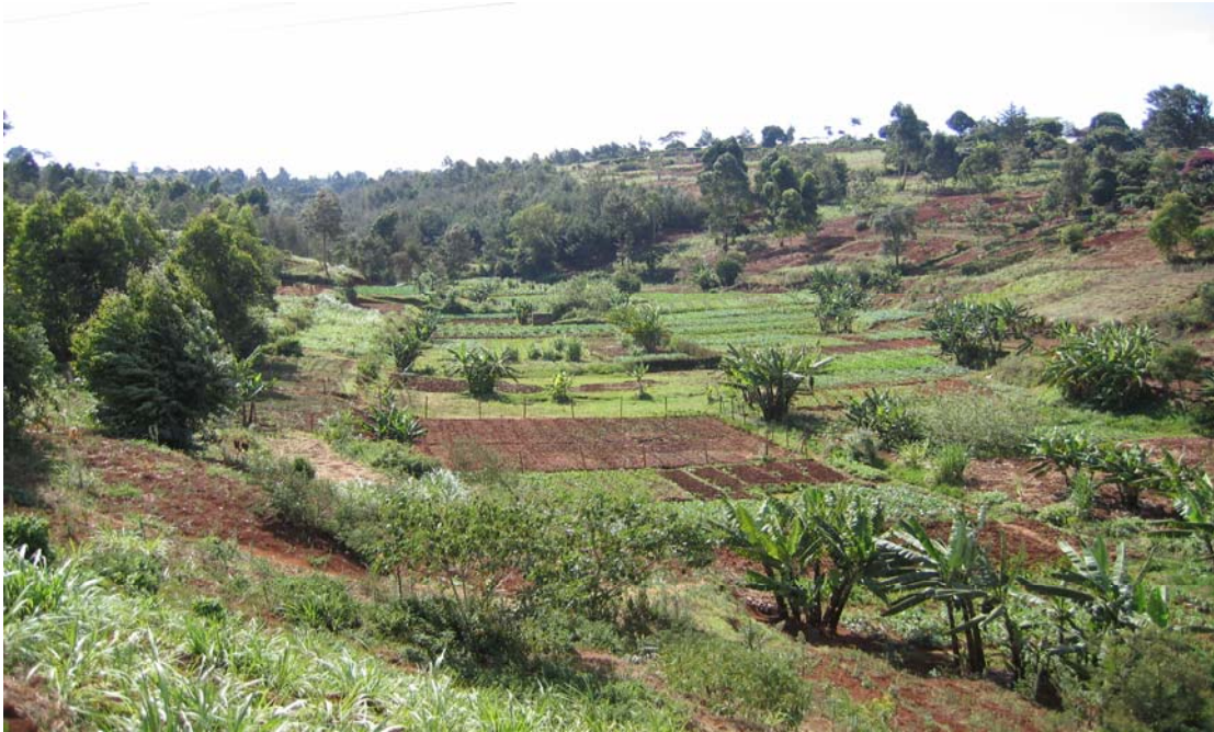
Sustainable land use

Agroforestry can contribute to the evolution of sustainable land use in EA drylands. This is possible because in the first place agroforestry as a concept was mooted, and evolved, with core concerns about ecological and economic sustainability – resilience of environment, diversity of income. It is a system that blends production (food and income security at household- and community-level) with ecosystem services.