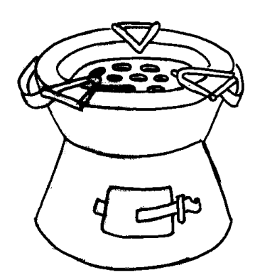
Figure 2: A variety of Improved Cookstoves