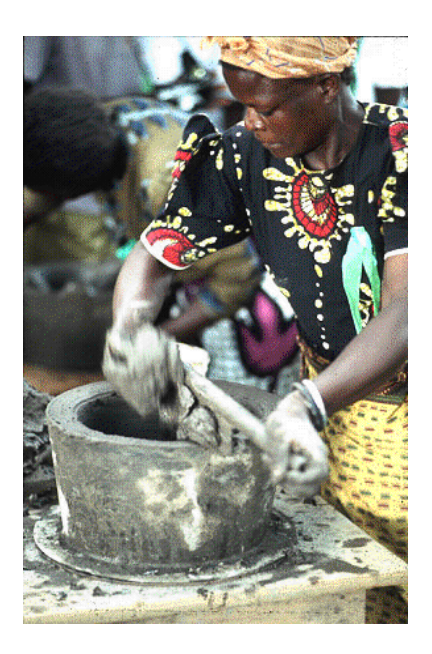
Figure 6: Women design and manufacture improved cook stoves.

For resource-poor women the working day stretched from dawn to long after dark. The pressures on women's time are heavy, cooking and fuel collection are among the most arduous of their tasks. The effects of inhaling biomass smoke during cooking are receiving attention from researchers; chronic bronchitis, heart disease, acute respiratory diseases and eye infections have been linked with smoky interiors, but the impacts of fuel shortage on cooking and nutrition are scarcely noticed.