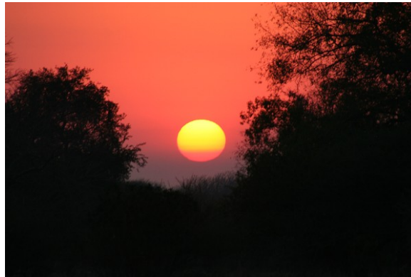
Figure 1: The sun is the source of most of the energy we use, either directly or indirectly.

Many solar thermal technologies have existed for centuries and are well understood. They have established manufacturing bases in many sun-rich countries. Unlike photovoltaic technologies manufacturing can be done on a small scale without using expensive equipment. More sophisticated solar thermal technologies do exist that generate electricity (often on a large scale) but these are not covered in this technical brief.