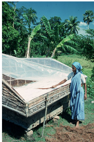
Figure 5: Coconut drying in Bangladesh.

On a domestic scale the cookers have limitations in terms of only being effective during hours of strong sunlight. Another cooking stove is usually required for the periods when there is cloud or during the morning and evening hours. Cooking time is often a lot slower than conventional