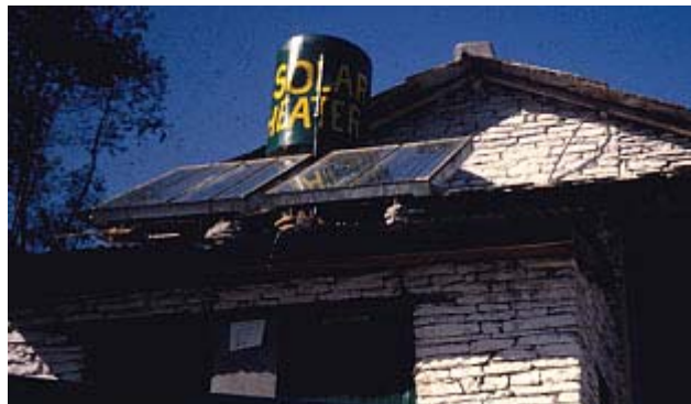
Figure 4: Solar water heating in Nepal.

The most common use for solar thermal technology is for domestic water heating. Hundreds of thousands of domestic hot water systems are in use throughout the world, especially in areas such as the Mediterranean and Australia where there is high solar insolation (the total energy per unit area received from the sun). Presently, domestic water heaters are usually only found amongst wealthier sections of the community in developing countries.