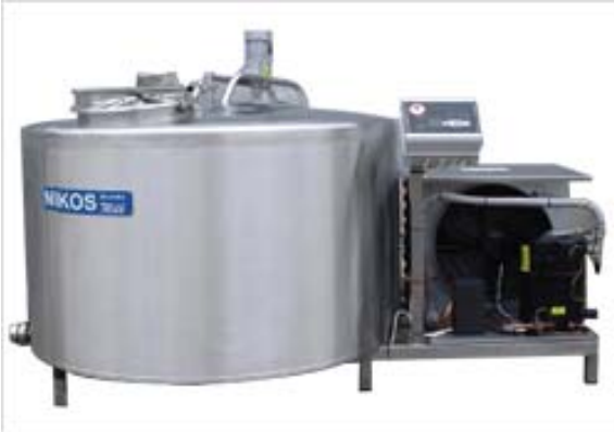
Figure 3: Milk cooler

Cooling does not destroy bacteria or enzymes but it slows down their activity. Cooled raw milk keeps its quality for a few days before it is processed. Milk products such as yoghurt, cheese, butter and pasteurised milk are also cooled to ensure they have the required shelf life for distribution to shops and retail storage. At the smallest (micro-) scale of operation, a refrigerator set at 4-5°C can be used to cool milk, but most dairy processors use a milk cooler (Figure 3) or cold store to cool milk in bulk before it is processed. Finished products should be stored in a separate dispatch store at 4°C +/- 2°C, or for frozen milk and ice cream, frozen in a freezer operating at below -18°C.