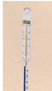
Figure 2: Lacto-densimeter with thermometer