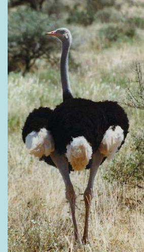
Struthio camelus Ostrich

Eventually, I was able to answer this simple question of why only some birds fly. Through this activity, you'll learn how to answer this question, too. Within this lesson, you will compare the ostrich to the bald eagle, discovering why these two birds evolved into the creatures they are now.