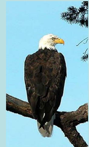
Haliaeetus leucocephalus Bald Eagle