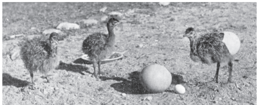
Newly hatched chicks, one with its shell still stuck to its backside.

A full-grown ostrich stands seven to eight feet high and weighs between 200 and 300 pounds. Its neck is about three feet long and the head has large eyes. To defend itself, the ostrich has an intense kick with lots of power from its thick legs. It kicks like a kangaroo. It has two toes which are