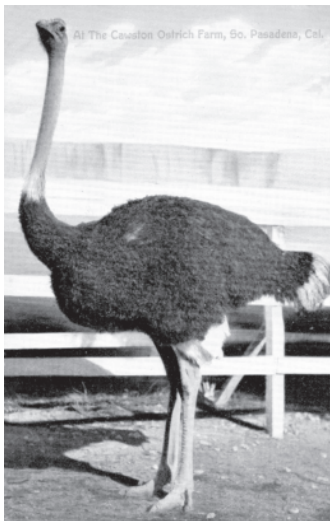
A full-grown bird is between seven and eight feet tall and weighs between 200 and 300 pounds. Its neck is about three feet long. Eggs weigh between three and four pounds.