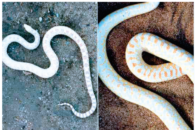
Figure 6. Wild-type and amelanistic forms of the Pacific Gopher snake, P. c. catenfer .