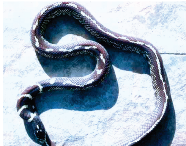
Figure 5. Wild-type California kingsnake, L. g. californiae . This is an aberrant form which combines the two known wild-type patterns of banding and striping.