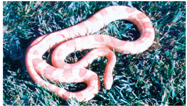
Figure 11. Amelanistic corn snake, E.g. guttata .

and his into a list of twenty questions that could be asked about organismic relationships. Scherer (1994) defined hybridization in terms of basic types "Two individuals belong to the same basic type if (i) they are able to hybridize ...(ii) they have hybridized with some third organism."