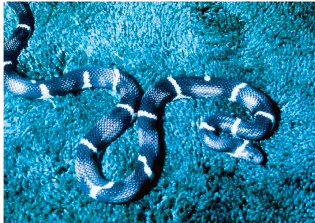
Figure 18. Interspecific F1 hybrid between the Sinaloan milk snake, L.t. sinaloae , and the California kingsnake, L.g. californiae .