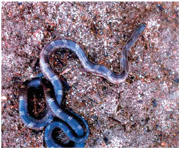
Figure 8. Wild-type black rat snake, E.o. obsoleta .