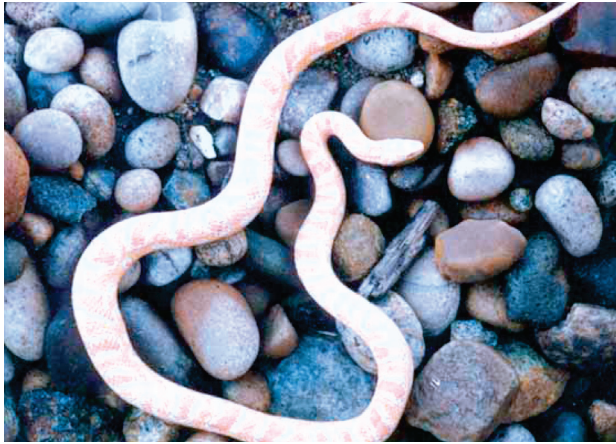
Figure 20. Amelanistic F1 hybrid between a Pacific gopher snake, P. catenifer , and a corn snake, E.g. guttata .