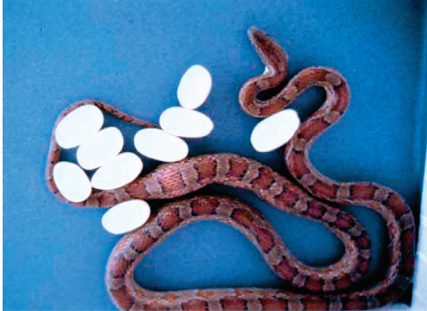
Figure 7. Wild-type corn snake, E.g. guttata .