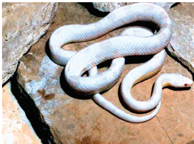
Figure 1. Corn snake E. g. guttata , which is homozygous recessive for both amelanism and axanthism. This type of mutation is called a snow corn because of the overall white coloration.

A few types of pattern anomalies have been identified in snakes. Generally these abnormalities change the typical pattern to a patternless or longitudinally striped pattern. Striped pattern mutations have been identified and propagated in the following species: P. c. catenfer , L. g. californiae , E. g. guttata , B. constrictor constrictor , P. regius , P. reticulatus , L. calligastar calligastar , L. alterna , R. leconte E , and Morelia spilota variegata . All are