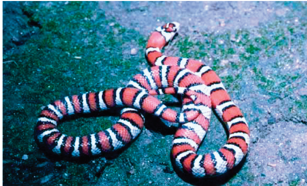
Figure 15. Interspecific F1 hybrid between the Arizona mountain kingsnake, L.p. woodeni and the San Luis Potosi kingsnake, L.m. mexicana .