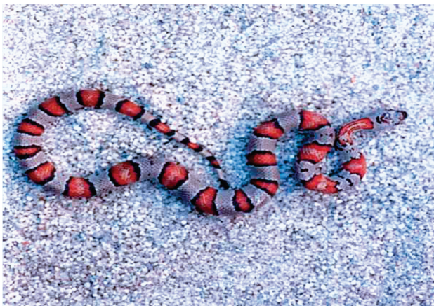
Figure 16. Interspecific F1 hybrid between the gray-banded kingsnake, L. alterna , and the San Luis Potosi kingsnake, L.m. mexicana .