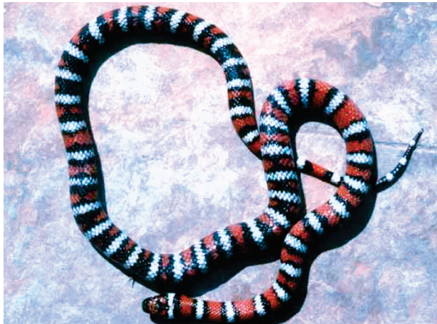
Figure 3. San Pedro Mountain kingsnake, L. z. agalma.