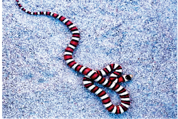
Figure 17. Interspecific F1 hybrid between the Durango mountain kingsnake, L.m. "greeri" and the Queretaro kingsnake L. ruthveni .