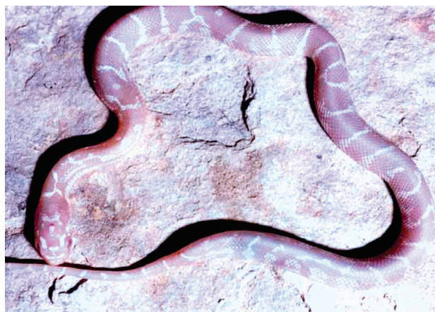
Figure 24. Intergeneric F2 jungle corn hybrid. This is the first snow jungle corn ever produced and displays the two recessive colorations of amelanism and axanthism simultaneously.

Because the original male corn snake that was used in this experiment was a “snow,” meaning that it was homozygous recessive for not only amelanism but also axanthism, it was able to pass these alleles on to its offspring. As a result, all of the F1 young that were produced from these breedings were heterozygous for the axanthic trait. Therefore, in the F2 generation some of the offspring that were produced displayed the similar “snow” coloration (Figure 24). While this demonstrates that the axanthic mutation is inherited the same in both genera, the findings are not as monumental as those for amelanism because no axanthic California kingsnake was available to perform the hybridizations. So it cannot be determined whether or not the axanthic mutations in the two species are also located on the same location of the chromosome.