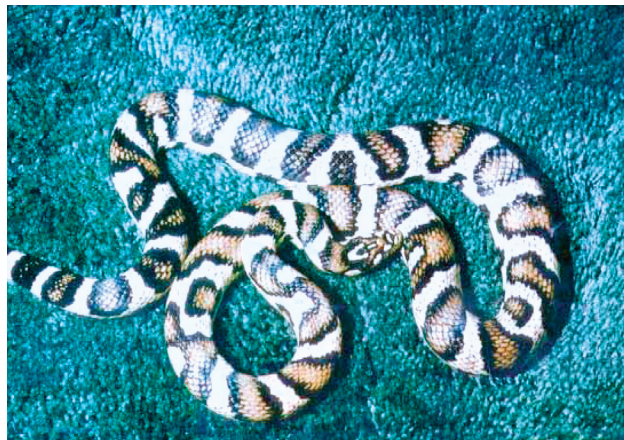
Figure 19. Wild-type F1 hybrid jungle corn, E.g. guttata × L.g. californiae .