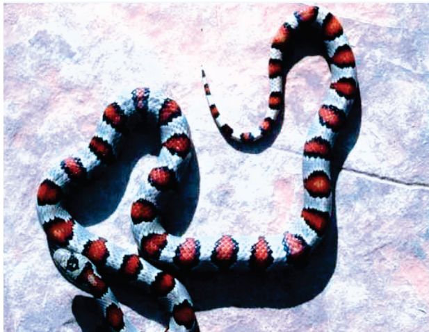
Figure 2. Durango mountain kingsnake, L. m. "greeri."

Additionally, amelanistic and axanthic lineages of L. g. californiae (Figure 10), P. c. catenfer (Figure 6), and E. g. guttata (Figure 11), as well as striped varieties of L. g. californiae and axanthic strains of E. g. guttata were utilized.