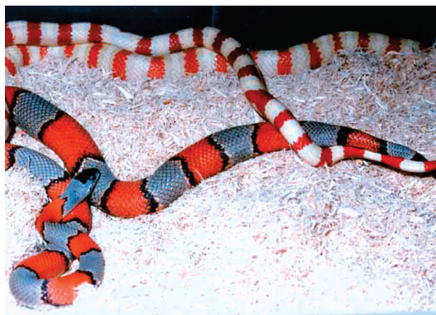
Figure 12. Hybridization between an amelanistic Queretaro kingsnake, L. ruthveni and a gray-banded kingsnake, L. alterna . In this figure the method of accomplishing these types of breedings is clearly illustrated. The anterior portion of the male is mounted on the torso of a female amelanistic Queretaro kingsnake, while his tail is breeding with a female gray-banded kingsnake.