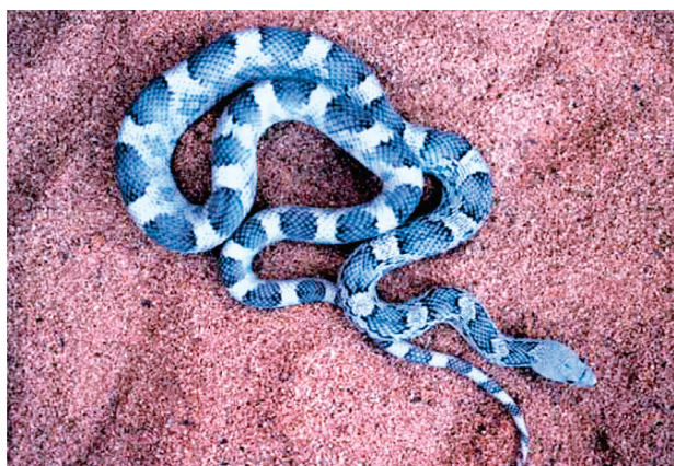
Figure 13. Intergeneric F1 hybrid between a black rat snake, E. o. obsoleta , and a northern pine snake, P. m. melanoleucus .

Photographs were taken of some of the parental stock as well as F1 offspring. For these pictures, a Nikon™ F1 SLR camera was used with 400 ASA Kodak™ color print film. Additionally, photographs were taken of any anomalies as far as color and pattern as well as of any F2 offspring which were unusual enough that they were markedly different from parental types—so much so as to discount “normal” variation.