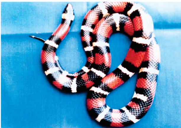
Figure 9. Sinaloan milk snake, L.t. sinaloae .

or discontinuity using four criteria. Wise (1990) formulated another biosystematic method which he called "Baraminology." He first redefined Marsh's baramin to include the first individual of the created kind (archaeobaramin) and all its descendents. Then, he identified various criteria by which membership might be defined. In his "Practical baraminology" paper (Wise, 1992) he integrated ReMine's criteria