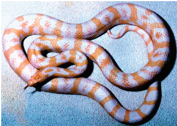
Figure 22. Amelanistic F1 hybrid jungle corn, E.g. guttata × L.g. californiae .