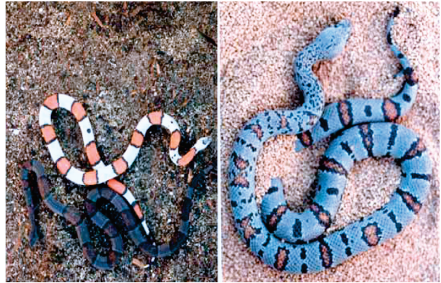
Figure 4. Three variations on the wild-type gray-banded kingsnake, L. alterna . In this highly variable species, while the background colors can vary in intensity, there exist two distinct forms of pattern: the Blair's phase, consisting of red-orange saddles on a gray background and the alterna phase, consisting of thin red bands alternating with thin black bands. While examples of both phases were used in hybridizations, it appears that only the Blair's phase surfaced in the F1 and F2 generations.