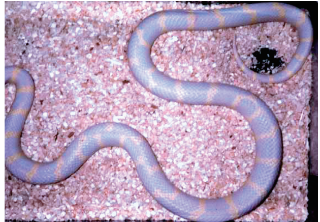
Figure 10. Amelanistic banded California kingsnake L.g. californiae .

or discontinuity using four criteria. Wise (1990) formulated another biosystematic method which he called "Baraminology." He first redefined Marsh's baramin to include the first individual of the created kind (archaeobaramin) and all its descendents. Then, he identified various criteria by which membership might be defined. In his "Practical baraminology" paper (Wise, 1992) he integrated ReMine's criteria