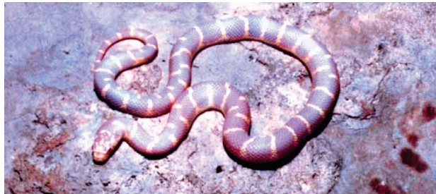
Figure 21. Intergeneric F2 hybrid, the result of a backcross of an F1 hybrid jungle corn, E.g. guttata with a California kingsnake, L.g. californiae . This F2 is 75% California kingsnake and 25% corn snake, yet is indistinguishable from a pure California kingsnake. This individual came from a clutch with a relatively high fertility rate of 88%.