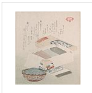
Cakes and Food Made of Seaweed by Kubo Shunman, 19th century