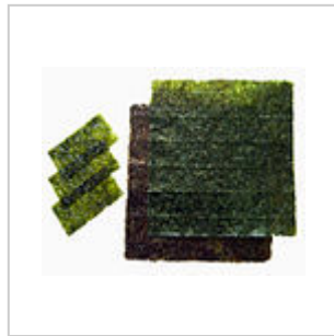
Roasted sheets of nori are used to wrap sushi