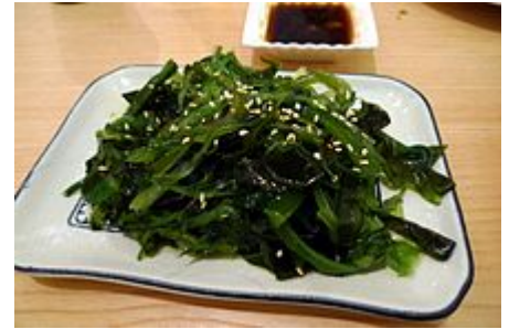
A dish of pickled spicy seaweed

The dish often served in western Chinese restaurants as 'Crispy Seaweed' is not seaweed but cabbage that has been dried and then fried. [4]