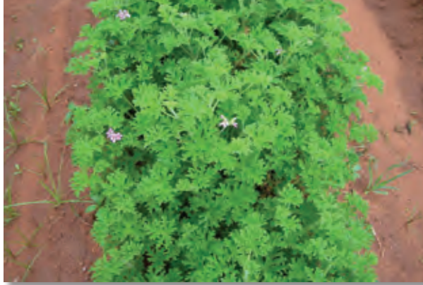
Pelargonium cv. rosé