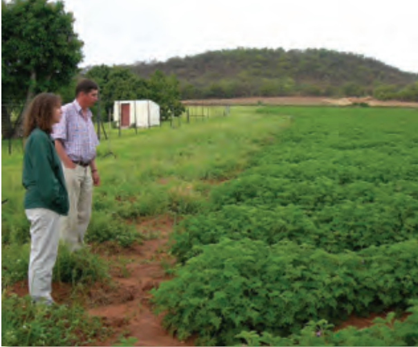
Scouting for pests and diseases on a regular basis is a recipe for success as done on this farm in Mpumalanga