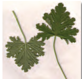
Pelargonium cv. rosé

Leaves and stalks are the essential parts of this plant. The essential oil is extracted from fresh plant material mainly using steam distillation.