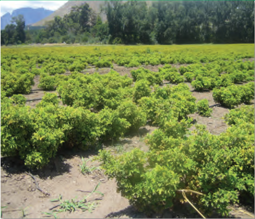
Pelargonium cv. rosé