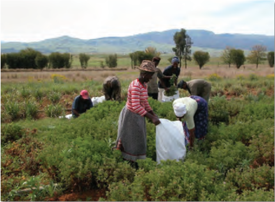
Hand harvesting of rose geranium on research trials in the Eastern Cape