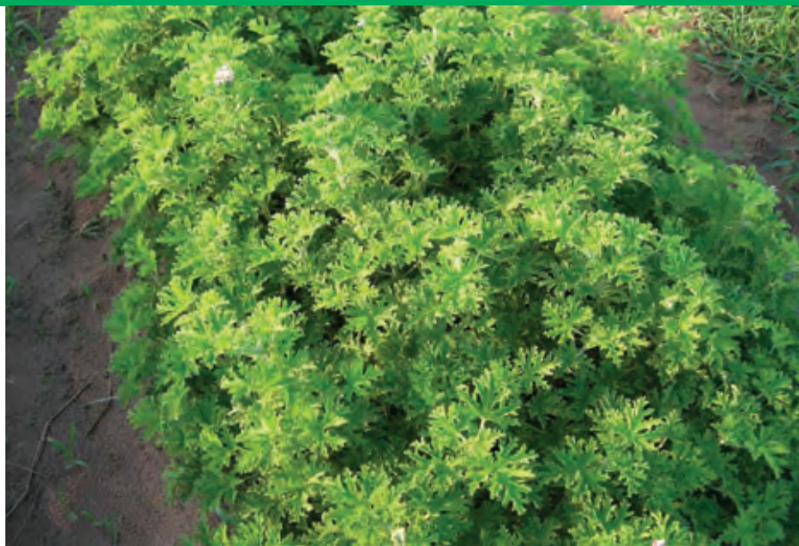
The time of harvesting affects the yield and quality of the oil