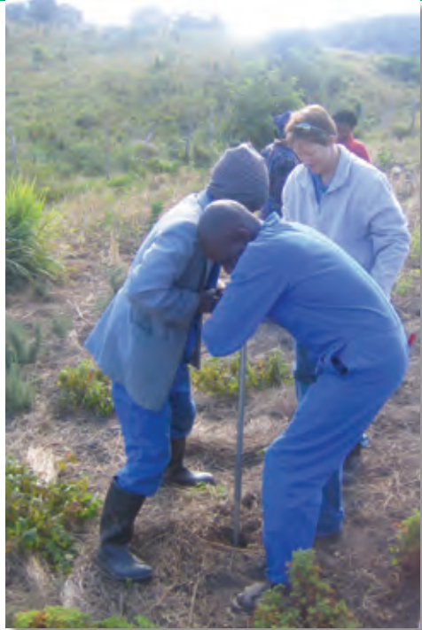
Farmers taking soil samples for analysis

Producers who treat their soil correctly will have the benefit of producing crops of high value with less input in terms of weed, pest and disease control.