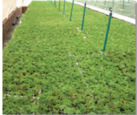
Propagation of cuttings in nurseries