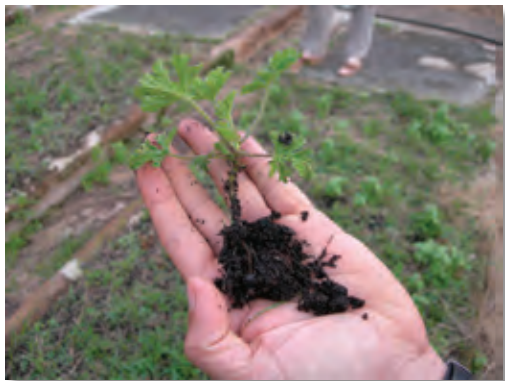
Healthy rooted cutting