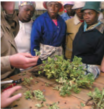
Cuttings being made

Cuttings can also be made successfully from older wood. Cuttings of 15 to 30 cm in length can be planted directly in the rows if these are strong and healthy. The fields should have enough moisture to ensure survival or irrigation must be supplied. Cuttings are susceptible to fungus attack such as damping off and have to be treated with a suitable fungicide.