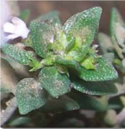
T. vulgaris leaves