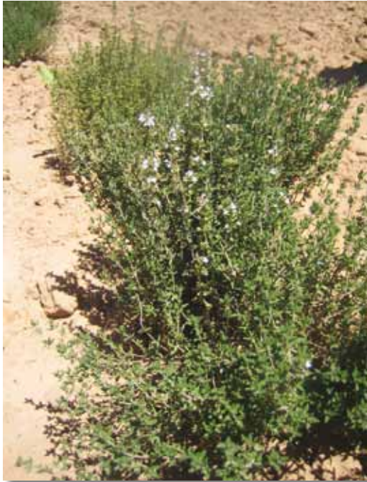
Thymus vulgaris