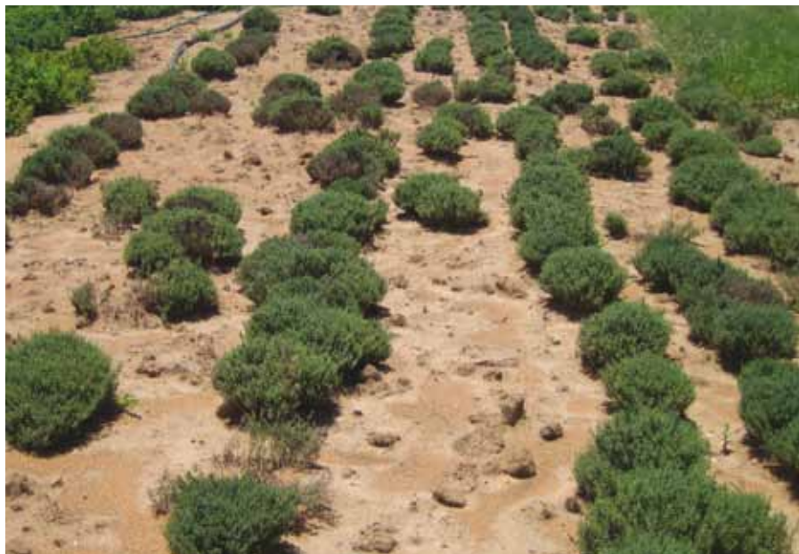
Thyme on research trials in North West