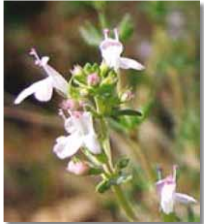
Thyme in the flowering stage

oval to oblong in shape and somewhat fleshy. Leaves are almost stalkless with margins curved inwards and highly aromatic. The fragrance of its leaves is the result of an essential oil, which gives it its flavouring value for culinary purposes, and is the source of its medicinal properties.