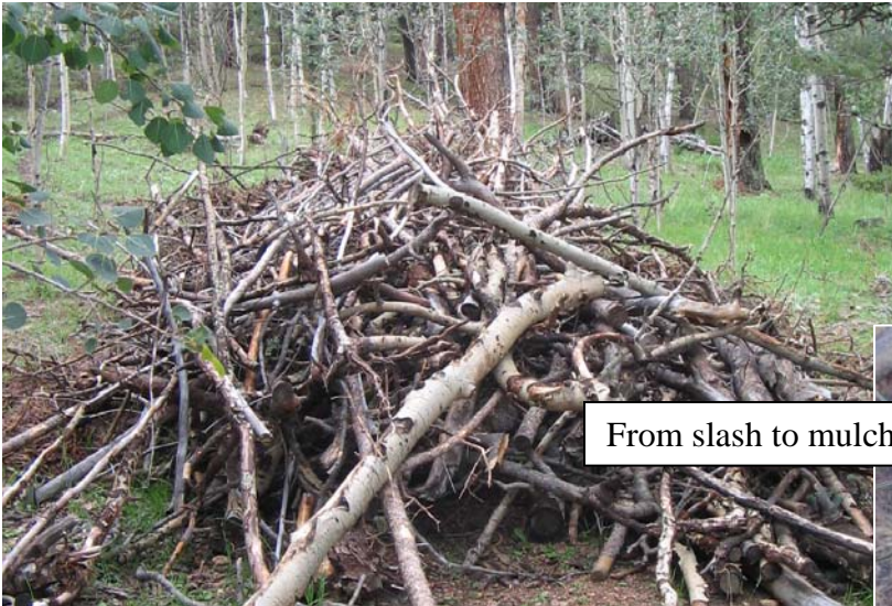
From slash to mulch

Weekends Only – April 17 th thru November 1 st Fri 12-4, Sat & Sun 9-3