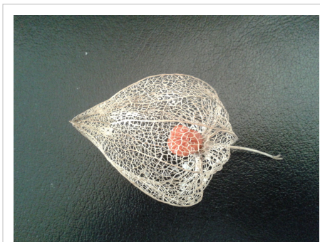
Physalis alkekengi , or the Chinese Lantern, blooms during Winter and dries during Spring. Once it is dried, the bright red fruit is seen. The outer cover is a thin mesh that held the flower petals, seen in golden colour