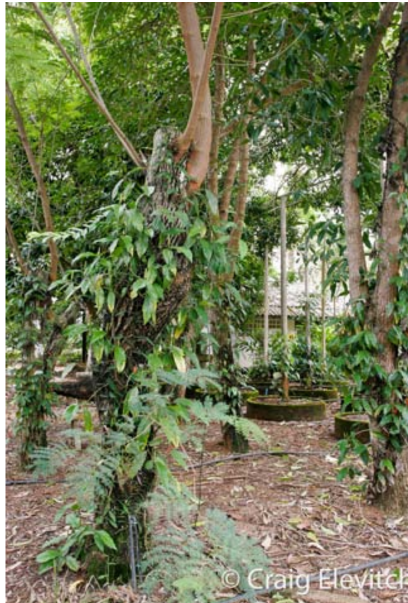
Left: A polyculture of black pepper and dragon fruit growing on a trellis of tamarind. Right: Pepper plants trellised on Leucaena trees.