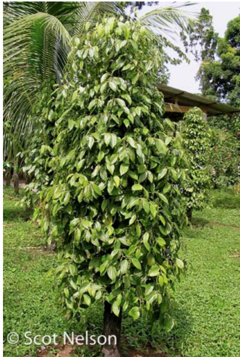
Home garden production. Pohnpei.

Yields per plant: a full-grown (7–8 years old), well developed mature vine can yield about 1.8–2.3 kg (4–5 lb) of dried berries each harvest season. About 11,230 kg/ha (10,000 lb/acre) of green berries can be produced, which converts to 3,140 kg/ha (2,800 lb/ac) of dried white pepper or about 3,930 kg/ha (3,500 lb/ac) of dried black pepper. There are