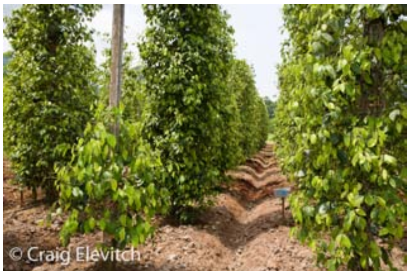
Top left: Preparing stolon cuttings for planting. Pohnpei. Top right: Vines climbing on fern stem support. Pohnpei. Bottom left: Pepper plants being established on fern stem posts. Pohnpei. Bottom right: Pepper plants growing on concrete posts. Thailand.

rich in humus, making it an excellent agroforestry cropping plant. However, too much shade reduces yield. Pepper plants also respond well to organic fertilization from mulch materials collected in or near forests.