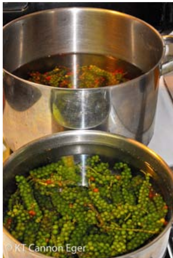
Left: About 1 kg (2.2 lb) freshly harvested peppercorns. Right: A 10-minute soak of berries in near-boiling water.