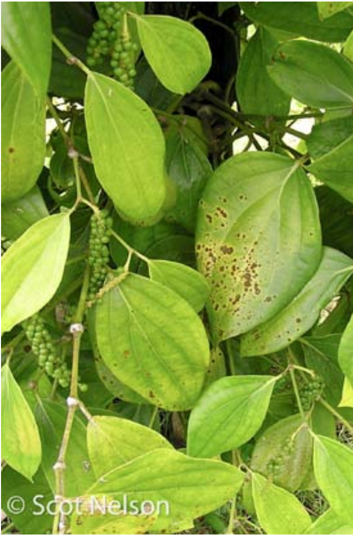
Algal leaf spot of pepper caused by a Cephaleuros species. Pohnpei.

Nutritional deficiencies for pepper plants may appear in fields with inadequate irrigation or insufficient amendments of fertilizers or mulches.