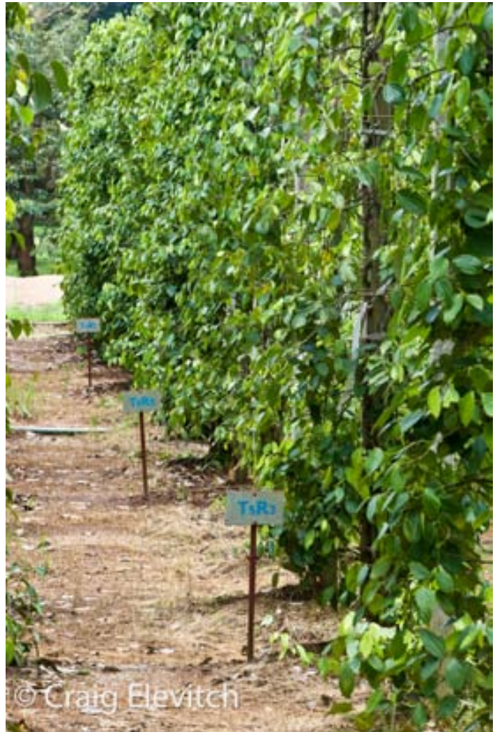
Variety trials. Thailand.

The primary center for germplasm of P. nigrum is India, where large collections are grown at various sites associated with the Institute of Spices Research. Other important col-