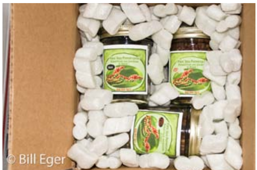
Jars of dried black pepper packed for shipping. Hawai'i.

Labeling should include information specific to the product. Labeling of pepper products can follow the coffee model: using terms that add value, such as single estate, hand-picked, sun-dried, and organic (if certified by a third party). A mention of the pepper variety or location could be made on the label.