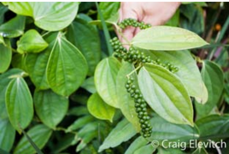
Green pepper berries and leaves.