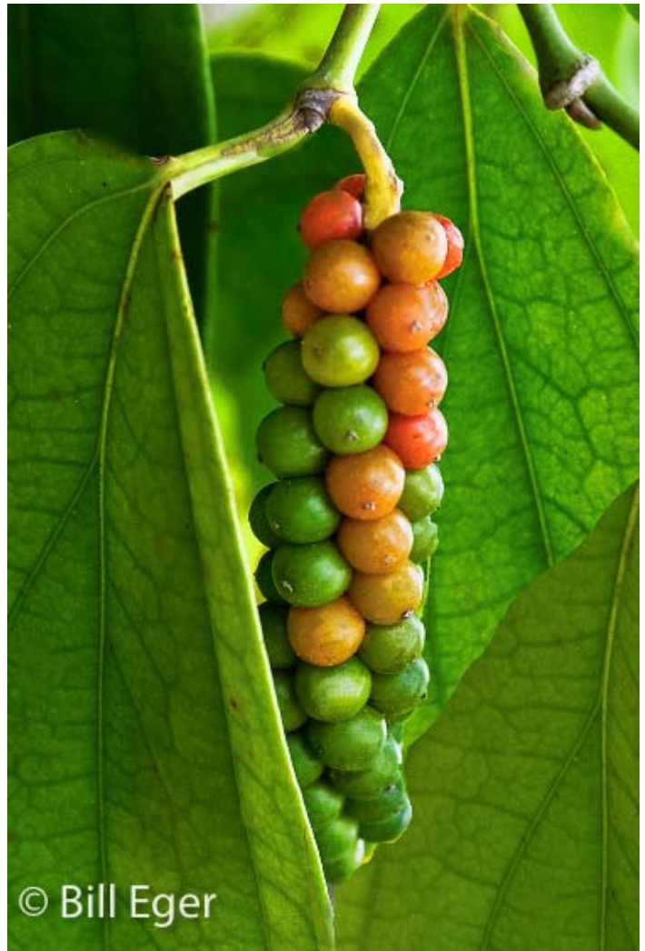
Cluster of ripening peppercorns.