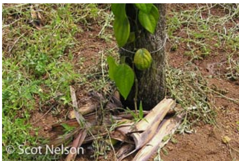
Left: Shading young pepper vines with palm fronds. Thailand. Right: Mulch applied at base of a young pepper vine. Pohnpei.