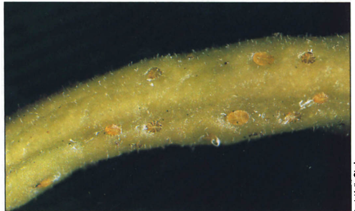
Jack Kelly Clark

Adult female psyllids (top) deposit translucent white eggs (above left) on tender new growth of the California pepper tree. When the eggs hatch, the nymphs (right) create pits on leaflets and other plant parts. The pits cause discoloration and disfigurement of leaflets (below) and extensive loss of leaves in the winter and early spring before the new flush of foliage is produced.