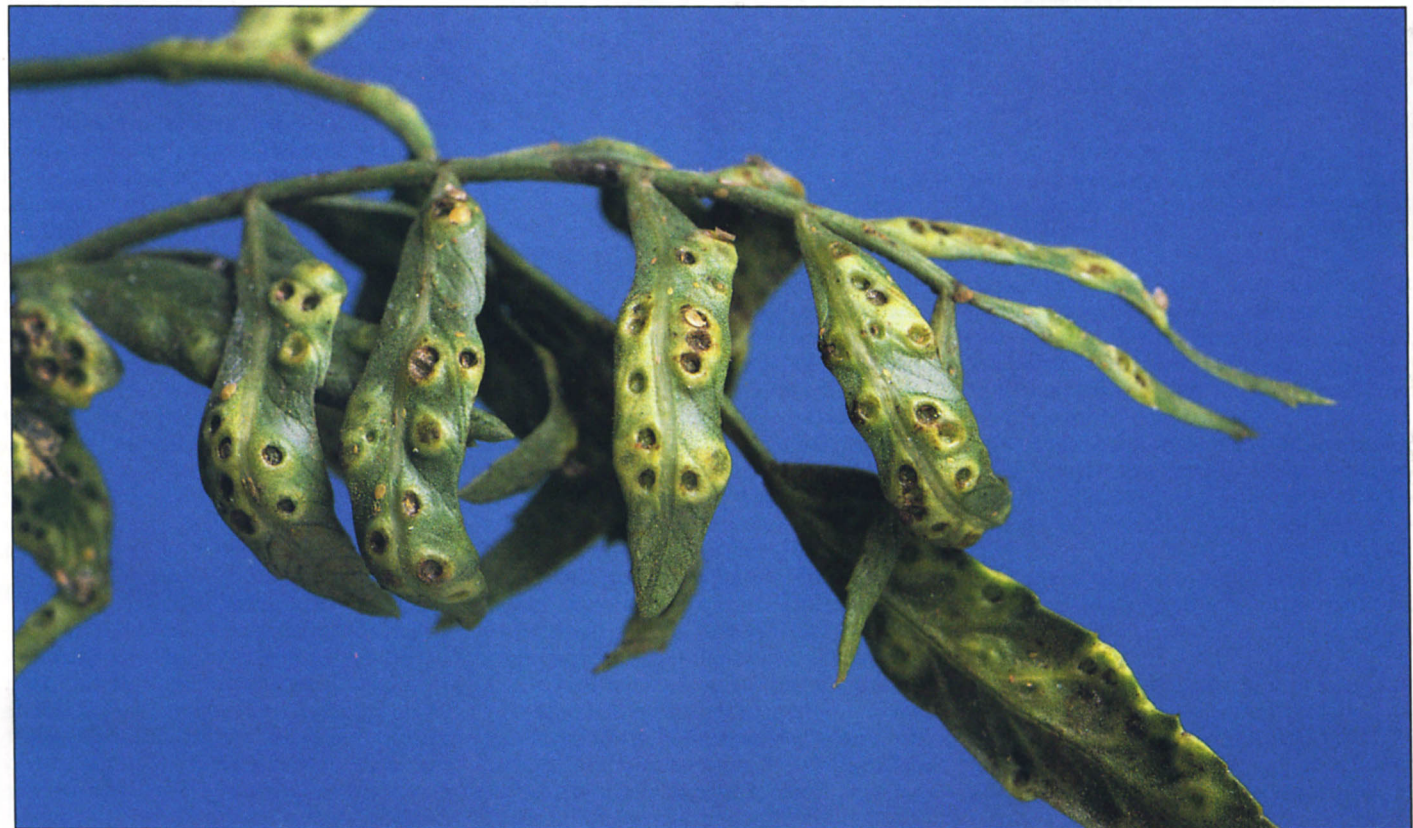
Jack Kelly Clark

Adult female psyllids (top) deposit translucent white eggs (above left) on tender new growth of the California pepper tree. When the eggs hatch, the nymphs (right) create pits on leaflets and other plant parts. The pits cause discoloration and disfigurement of leaflets (below) and extensive loss of leaves in the winter and early spring before the new flush of foliage is produced.