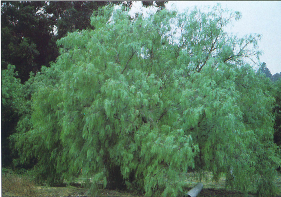
The California pepper tree is an evergreen, ornamental shade tree grown in much of the state. A pest new to California, the peppertree psyllid, is spreading rapidly in the coastal areas from San Diego to San Francisco. In its nymphal stage, the insect causes disfiguring pitting and discoloration of leaflets. High psyllid populations give infested trees a grayish color and cause heavy foliage drop during winter and early spring (right).