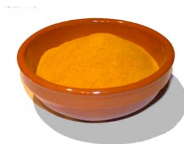
Figure 5: Ground Turmeric

Grinding is a very simple process that involves cutting and crushing the rhizomes into small particles, then sifting it through a series of screens of different mesh size, to get a fine powder. There are a range of grinding mills available, both manual and powered, of different capacities and which work in different ways. The traditional way to grind would be between two stones. The advantage of this method is that the turmeric does not get too hot during the grinding process. With some of the mechanical mills, such as a hammer mill, heat is