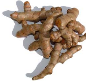
Figure 1: Fresh turmeric.

Turmeric ( Curcuma domestica ) is an erect perennial plant grown as an annual crop for its rhizome (underground rootlike stem bearing roots and shoots). It belongs to the same family as ginger ( Zingiberaceae ) and grows in the same hot and humid tropical climate. The rhizome is a deep bright yellow colour and similar form to the ginger but slightly smaller. The plant originated in the Indian sub-continent and today India is the worlds leading producer and consumer of turmeric. It is also produced in China, Taiwan, Bangladesh, Indonesia, Sri Lanka, Australia, Africa, Peru and the West Indies. Turmeric plays an important role in Indian culture- it is an essential ingredient of curry, used in religious festivals, as a cosmetic, a cloth dye and in many traditional health remedies. The spice is sometimes referred to as 'Indian saffron'.