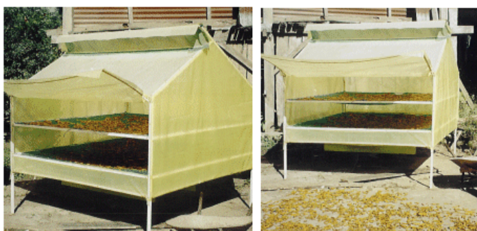
Figure 4: A typical solar drier developed in Bolivia http://www.fao.org/inpho/content/compand/text/ch29/ch29_02.htm