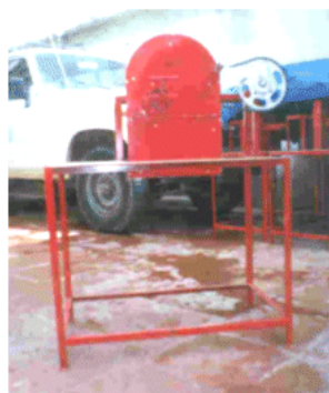
Figure 2: A simple slicing machine used in Bolivia.

The rhizomes are sliced before drying to reduce the drying time and improve the quality of the final product (it is easier to achieve a lower final moisture content in small pieces of rhizome without spoiling the appearance of the product). The rhizomes are traditionally sliced by hand, but there are small machines available to carry out this process. Figure 3 shows a simple turmeric slicing machine designed in Bolivia. It is a simple structure that contains a transmission system and two stainless steel circular blades. The machine is easy to build and maintain and can cut up to 120kg turmeric per hour.