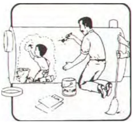
2. Silo Maintenance