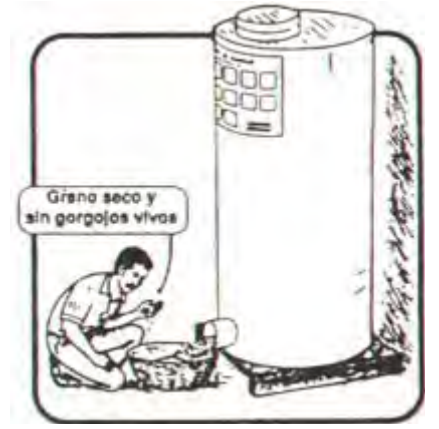
10. Periodical Checking: Dry Grain without Live Insects