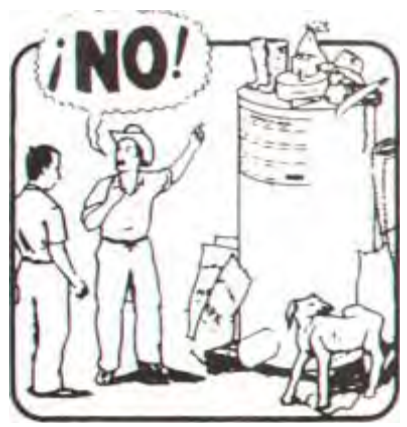
11. Silo Hygiene and Care: No