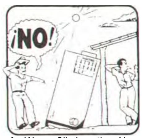
3. Wrong Silo Location: No