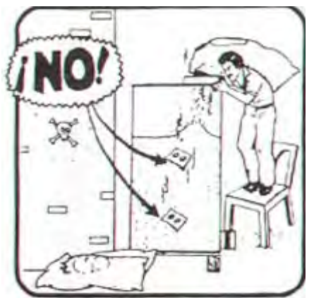
5. Incorrect Placement of Tablets: No