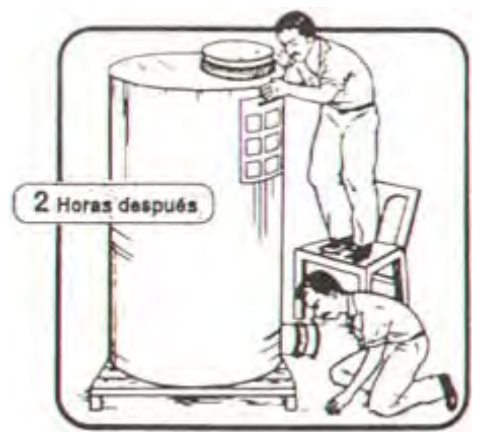
8. Checking for Leaks: 2 hours later