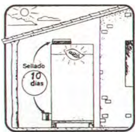
9. Fumigation Period: Sealed for 10 Days