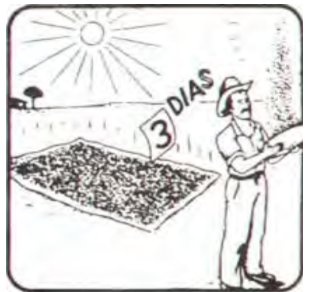
1. Drying and Cleaning: 3 more days