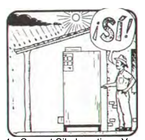
4. Correct Silo Location: Yes