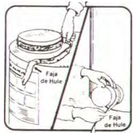
7. Sealing the Silo: Rubber Strip