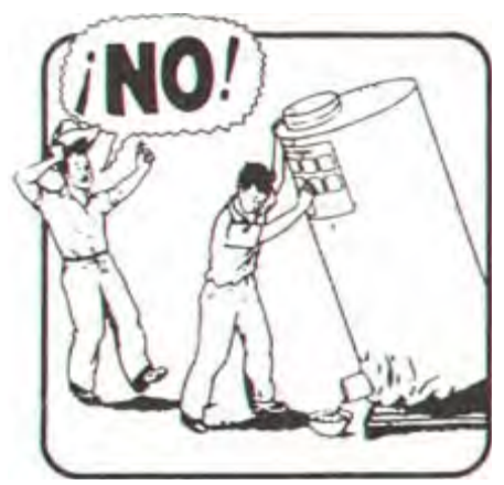
12. Wrong Emptying: No