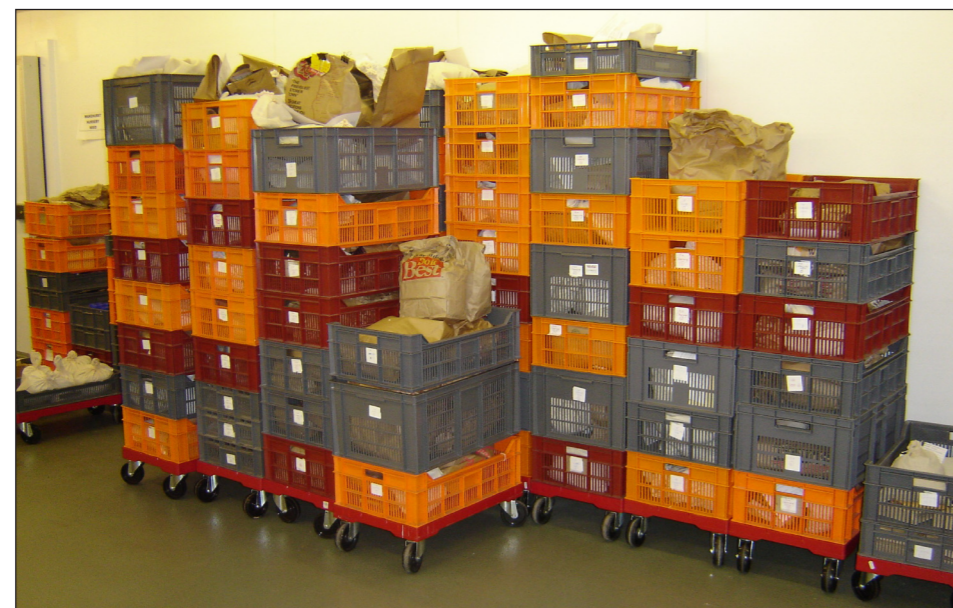
Below: Crates stacked on moveable trolleys in the MSB dry room, with seed collections contained in porous bags

The dryer creates heat during the drying process and should ideally be placed outside the room (in a ventilated area). Connect the drier to the room via insulated supply and extract ducts, of sufficient diameter not to impede air flow.