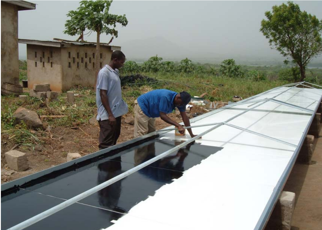
Figure 7: A Hohenheim dryer, Ghana. Black paint being applied to the collector.