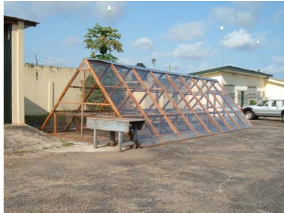
Figure 5: Large solar tent dryer, Ghana.