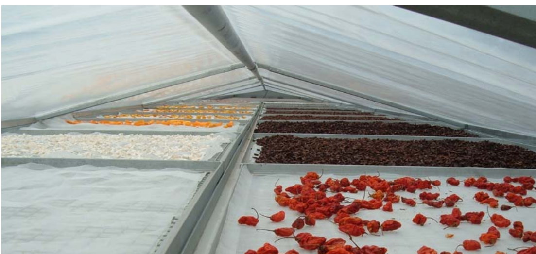
Figure 8: View inside a Hohenheim solar tunnel dryer.