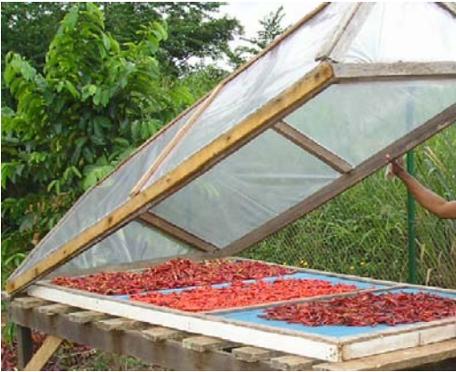
Figure 4: A small solar tent dryer, Ghana.

A much smaller tent dryer is shown below. Very similar to a cabinet dryer, it demonstrates the overlap in designs between solar dryers) :