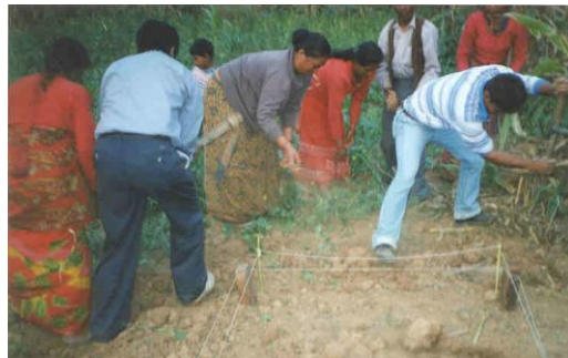
Figure 2: Laying out the groundwork for the dryer.

A small piece of land about 1.8m x 2.4m or 6'x 8' receiving sufficient sun is prepared as a platform. Bricks or stones (whichever is locally available) are laid down to make the base of the dryer. The dryer is slanted by about 20 degrees from ground level facing towards the equator. Small bamboo pipes are placed at certain distances along the wall of the dryer as inlets for cool air or holes can be made during construction. Small windows or gaps on the top of wall of the dryer are placed as outlets for hot air. Clay mixed with cow-dung and finely chopped hay or rice husk or sawdust is used as mortar and plaster. This