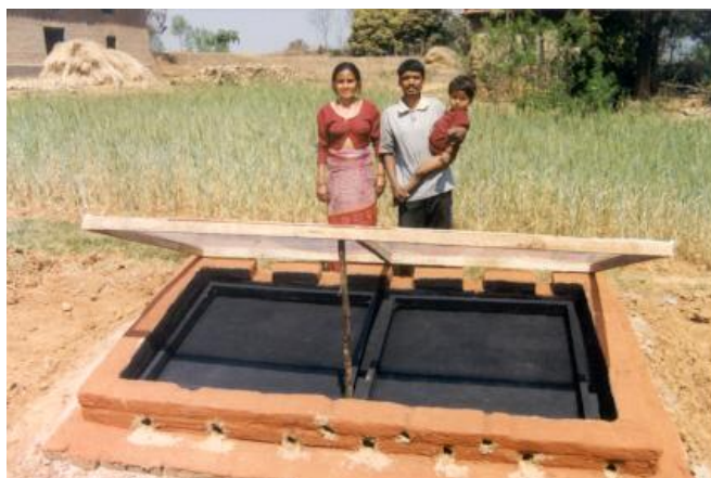
Figure 5: The finished dryer.

Producing Solar Dried Fruit and Vegetables for Micro- and Small-Scale Rural Enterprise Development: A Series of Practical Guides , written by the Natural Resources Institute .