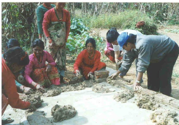
Figure 4: Laying the bricks.