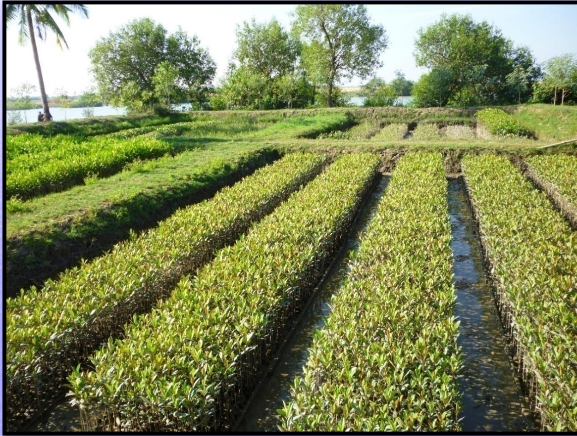
FREDA/EED Htaw Paing Mangrove Nursery