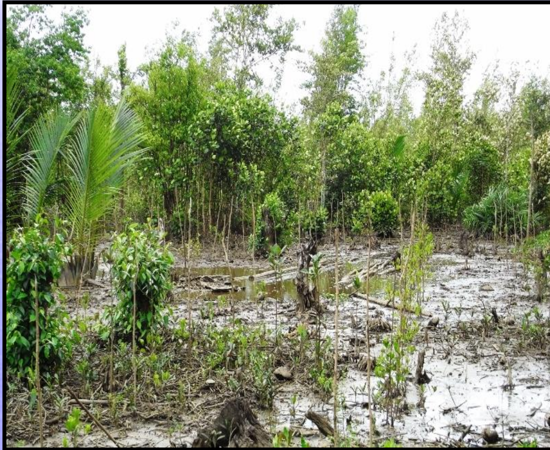
Wapana village, Ahmar Sub-township