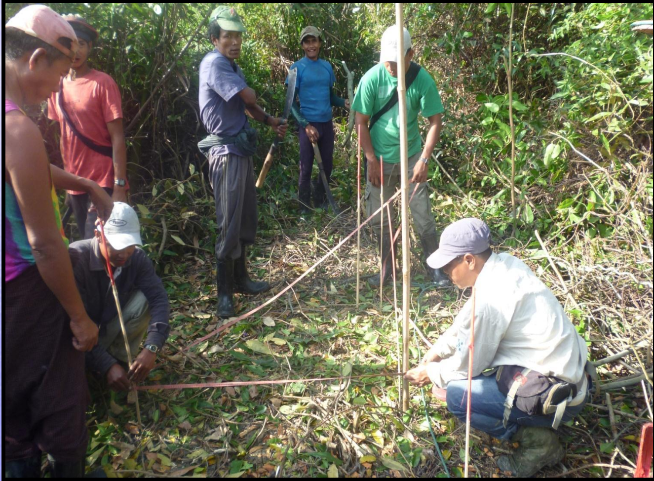
Boundary demarcation in Deedote Island