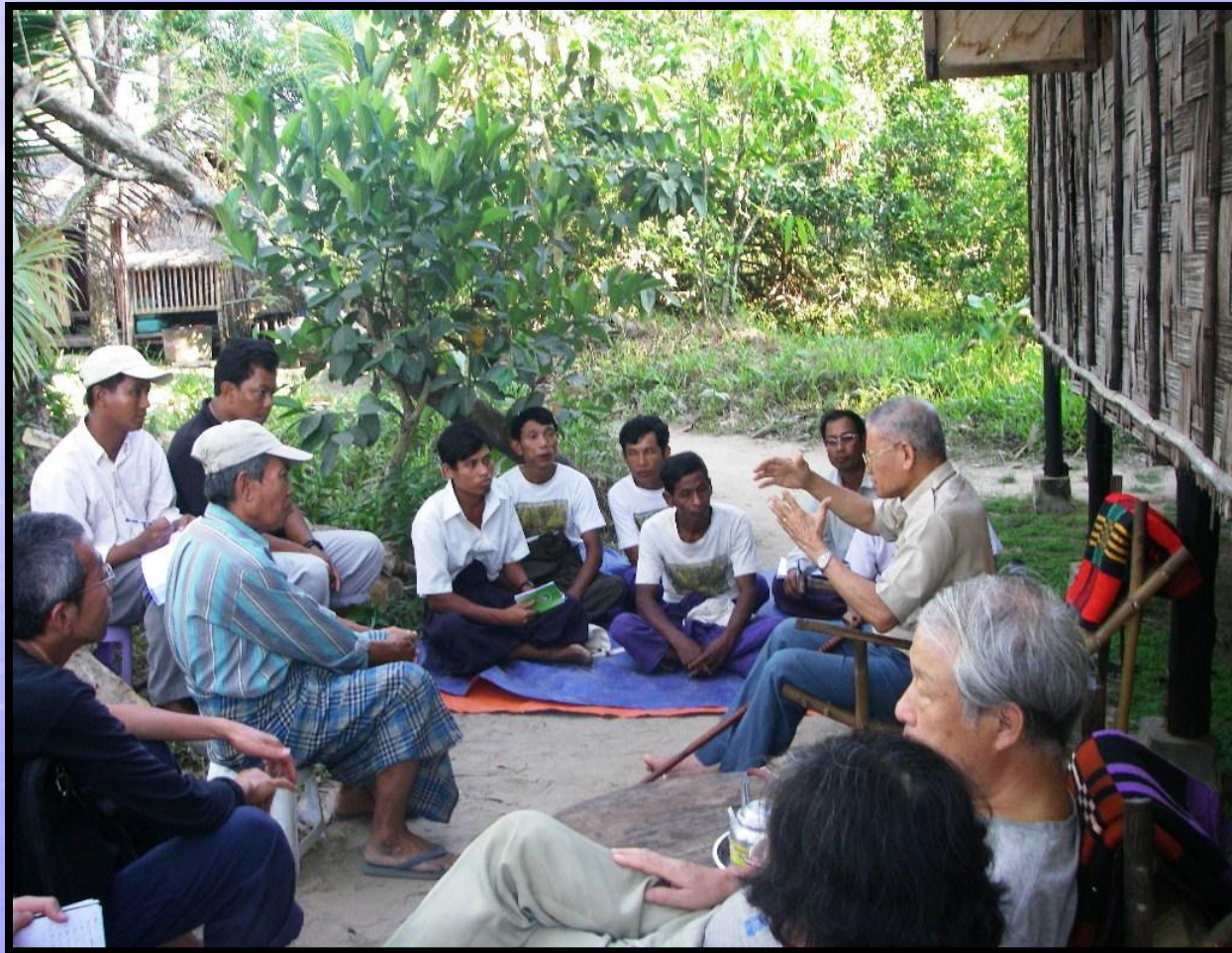
Kanyin kone Village, Ahmar sub-township