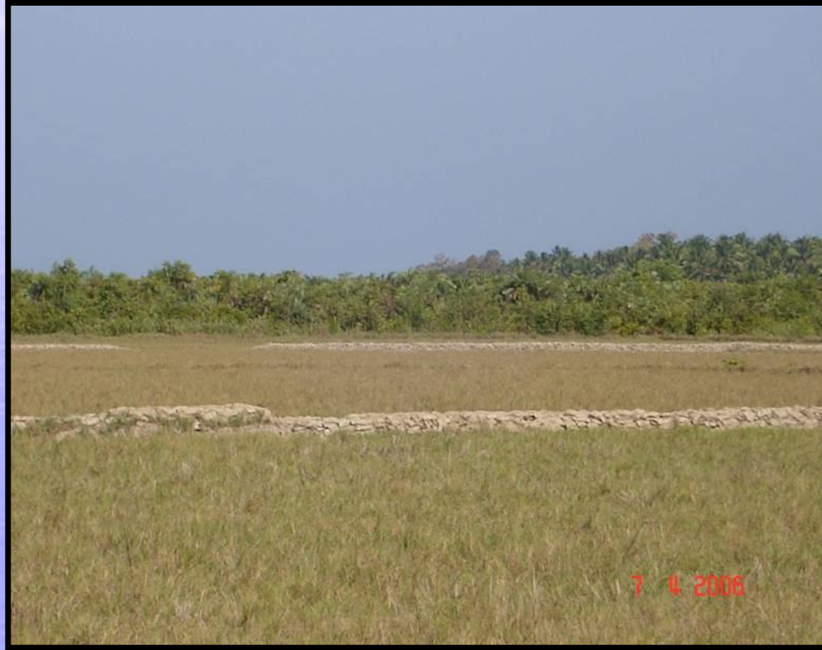
Pyindaye Reserved Forest