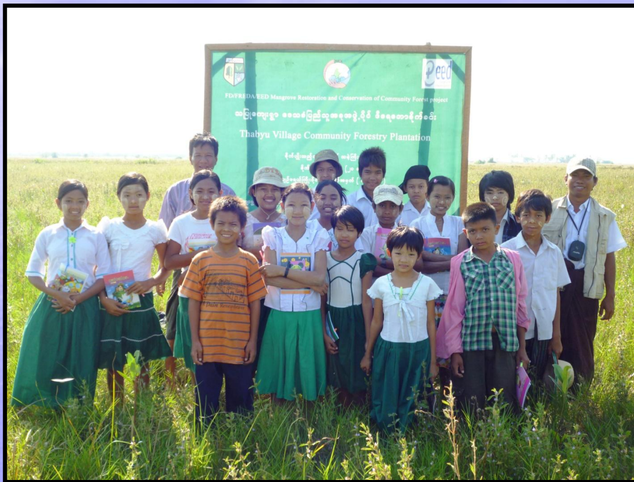
Thabyu village, Bogalay Township