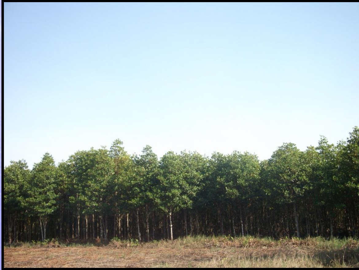
Bruguiera sexangula (2002) Plantation in Telbinseik village