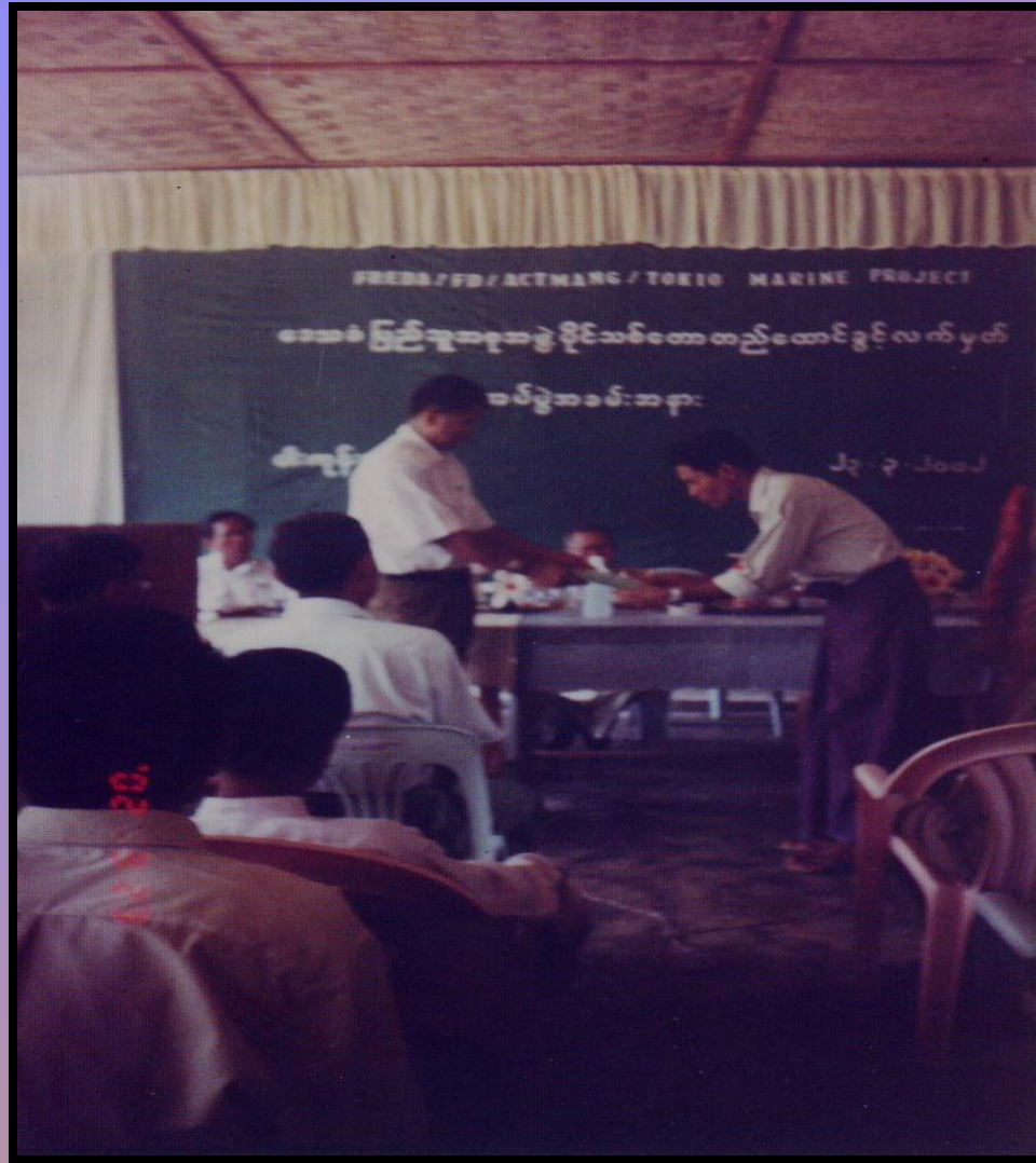
Warkone Village (2002)