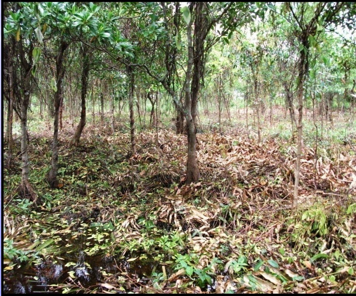
Bruguiera sexangula (2002)