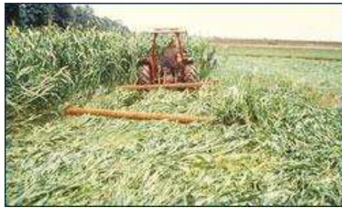
Picture9: Metal tubes behind a tractor used as cover crop crusher