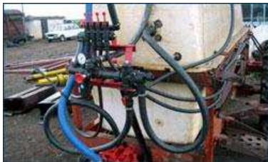
Picture21: Old sprayer upgraded with new pump, controls and spray lines