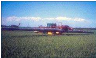
Picture20: Tractor mounted boom sprayer with air-sleeve for reduced drift