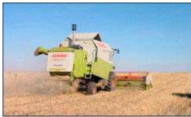
Picture11: Combine harvester with straw chopper