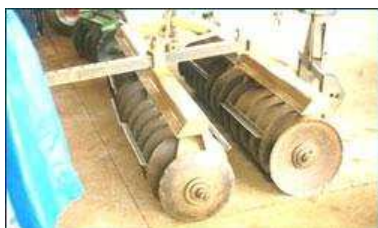
Picture8: Modified disc harrow to be used as knife roller