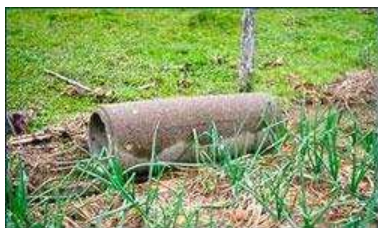
Picture4: A culvert used to crush the cover crop prior to onion crop