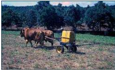
Picture18: Animal traction boom sprayer