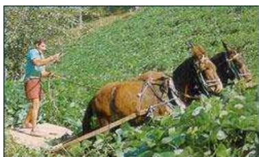
Picture5: A sledge drawn by horses to manage a cover crop of Mucuna