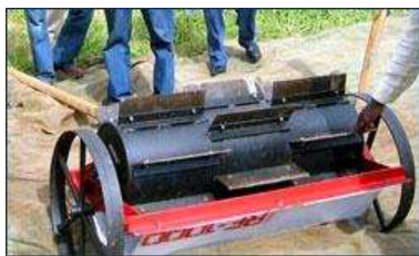
Picture3: Animal traction knife roller in transport position