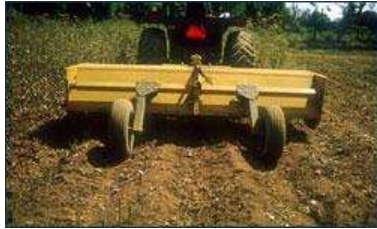
Picture10: Shredder used to chop cotton residues