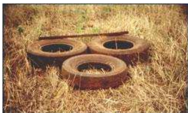
Picture6: Cover crop crusher made of old tyres