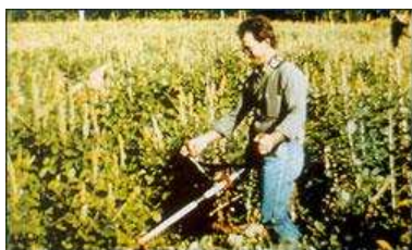
Picture2: A motorised rotary hand-held mower to control the vegetation