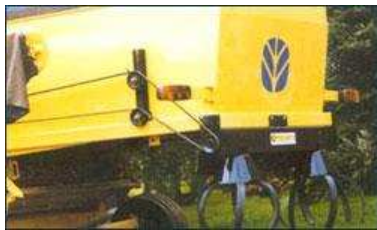
Picture12: Straw spreader on combine