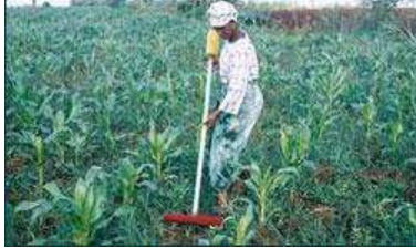
Picture17: Weed wiper