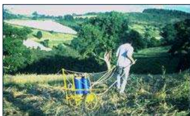
Picture15: An adapted knapsack sprayer for manual traction