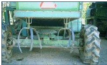
Picture13: Farmer-built straw spreader