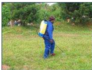
Picture14: The knapsack sprayer