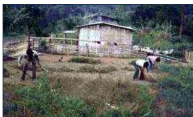
Picture1: The use of a machete or knife is a popular tool to control cover crops