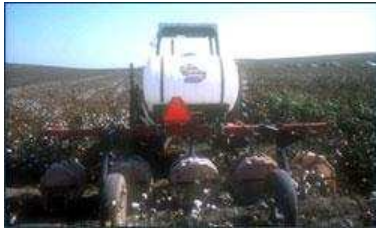
Picture19: Shielded row crop sprayer