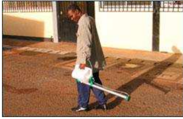
Picture16: Operator carried rotary nozzle herbicide sprayer