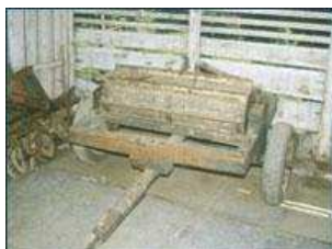
Picture7: Simple knife roller made from wood with metal bars