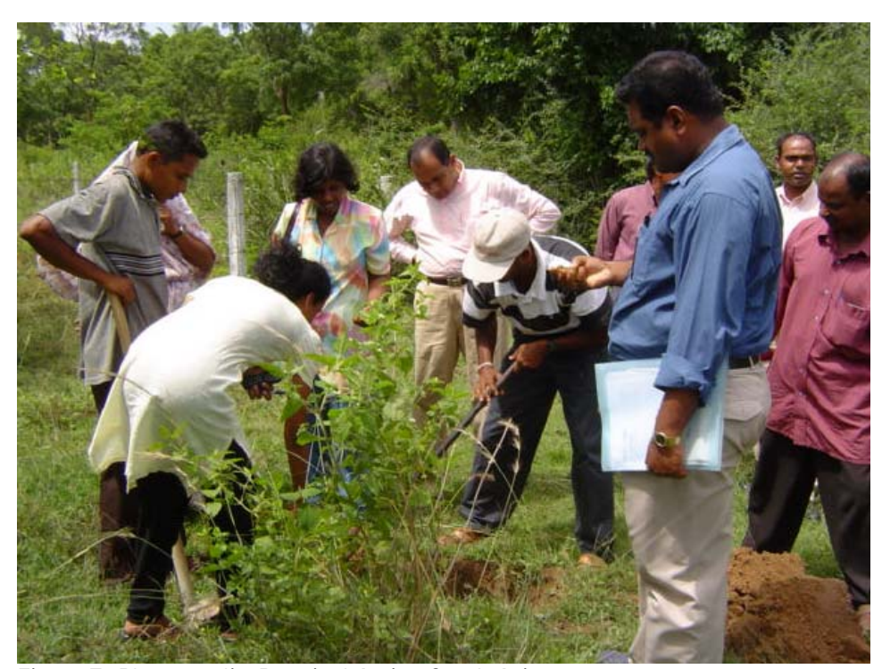
Figure 7: