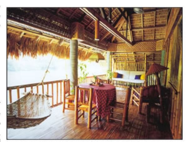
The best way to walk on a bamboo floor is barefoot. Allow the bamboo to shift with your weight, to flex and creak, and in return feel its smoothness against your skin, and know that it will support you.

Because bamboo demands its own craftsman, not all carpenters can build a bamboo house. A nail hastily placed will splinter the whole culm, and only experience gives the eye that can pick a mature reliable bamboo post. And what sort of knowledge is it that enables a builder to construct a house without a meter stick and vet cut eloquent proportions on a wonderfully human The bamboo itself becomes the means measure - the nodes on a fully-grown bamboo are