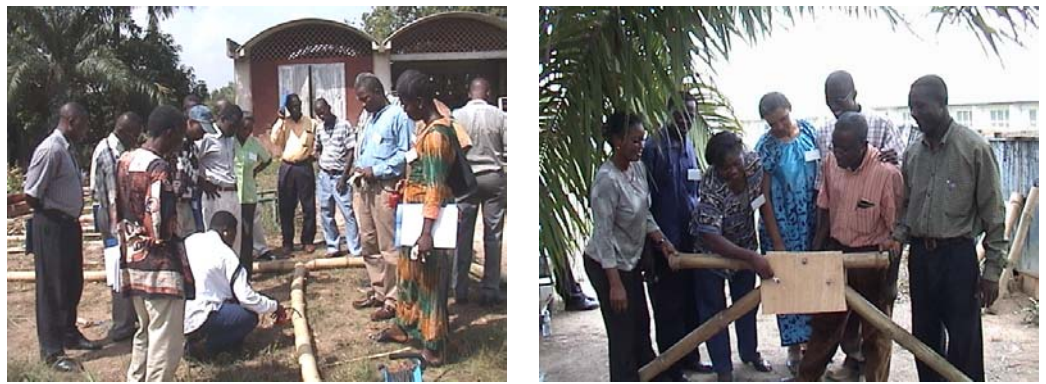
Practical session on bamboo jointing

The participants were taken to BRRI where each group was assigned a different type of bamboo joint to design and construct. Engineers and artisans were on hand to help participants understand the different types of joint and their applications, and to overcome any practical difficulties. The exercise gave the groups a real sense of involvement, giving the previous theory sessions a practical focus and resulting in fine work which the participants were very proud of.