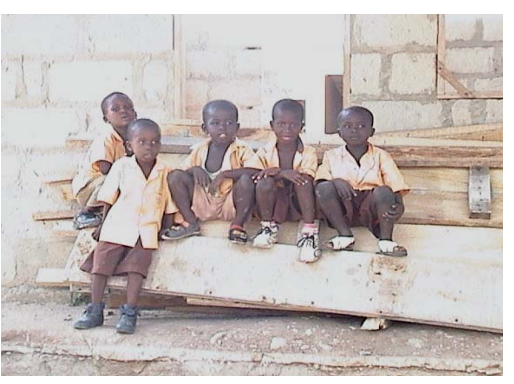
School children – hope for the future

In rural areas, shortages extend to basic public infrastructure. Only 76% of children obtain primary school education, decreasing to 37% at secondary school level. Many children in rural villages are deprived of primary education simply due to lack of school facilities in the village or immediate neighbourhood. Such circumstances demand cost-effective, quick and sustainable solutions. Bamboo construction offers significant potential, with simple technology able to provide permanent solutions to building shortages nationwide.