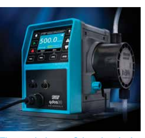
The revolutionary Qdos chemical metering pump

Delivering knowledge, service, and products of such excellence that users will seek Watson-Marlow Fluid Technology solutions at every opportunity.