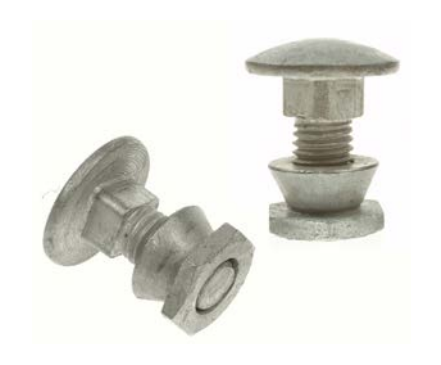
Corner post clamp