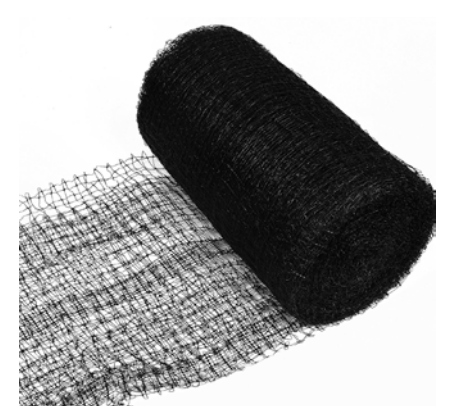
Extruded bird netting