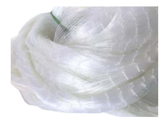
Knotted bird netting

Anti-bird netting is usually wrapped by blister card, paper boxes or plastic film, we also packing according the requirements of customers. Bellow are some common package styles.