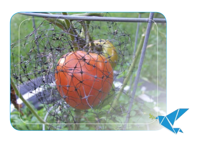
Bird netting protect tomato