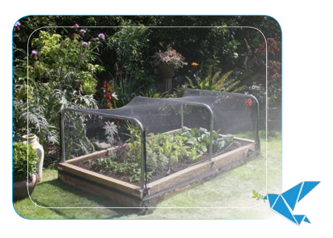
Bird netting protect tomato