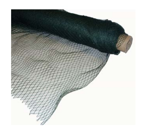
Knitted bird netting