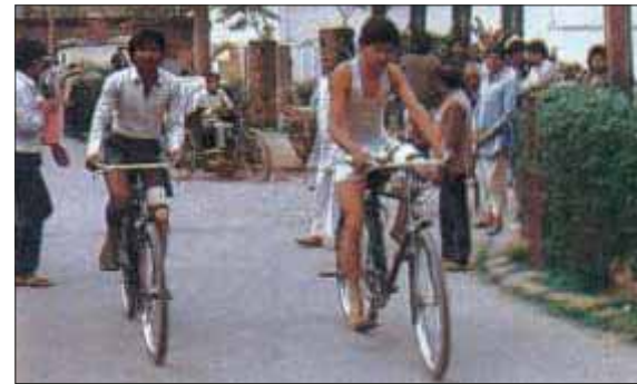
Cycling without any discomfort