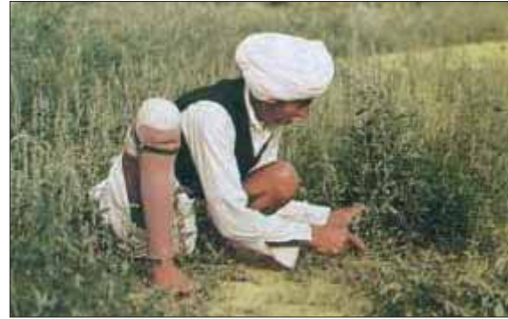
Easy working in the fields

We strive for perfection to serve the disabled in a better way. The advantages of Jaipur Foot over SACH Foot of western type are (refer page 4).