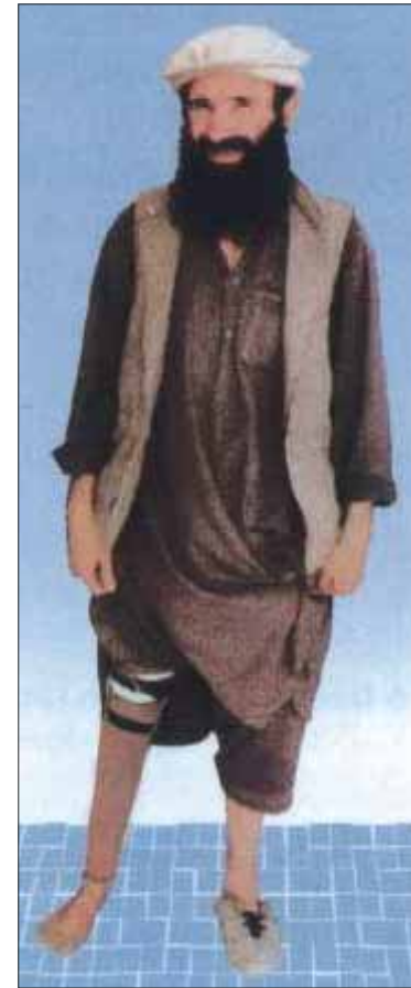
A below-knee amputee fitted with Jaipur limb in Kabul, Afghanistan

The above knee prosthesis are made with IPOS brims providing ischeal c o n t a i n m e n t sockets - the most advanced socket system in the world.