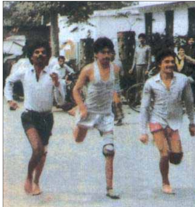
Run and run fast