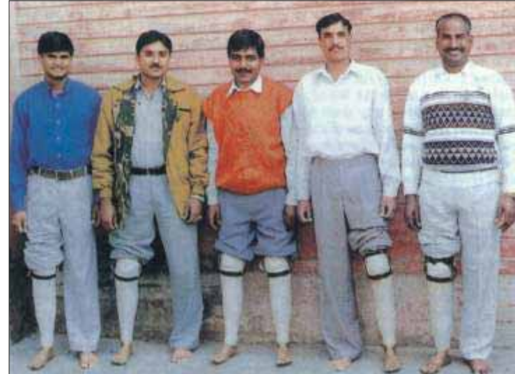
Soldiers who lost their limbs during Kargil war, fitted with Jaipur foot in our Camp.