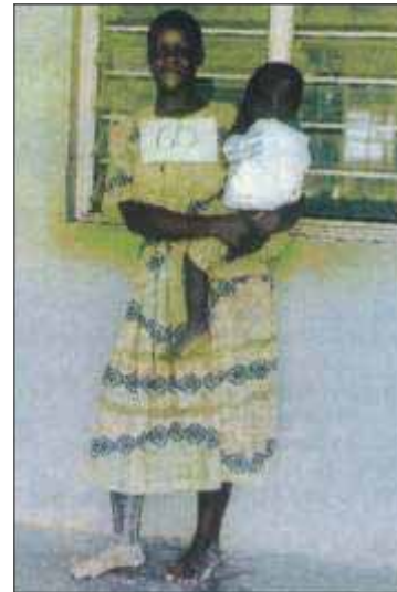
A mother in Uganda fitted with Jaipur foot comfortably holding her child

Indeed, disability and poverty often compliment and compound each other. The problem is further complicated by the lack of education. In this backdrop, the Society has evolved an appropriate, simple, informal, humane and patient friendly delivery system under which artificial limbs, calipers, other aids and appliances, economic assistance and other help are provided easily and free of charge.