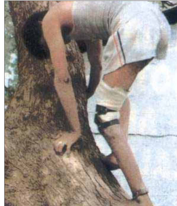
One can climb a tree