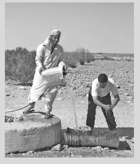
Cistern in northern Egypt.

Improvement of agricultural productivity in the dry areas goes through the development of land