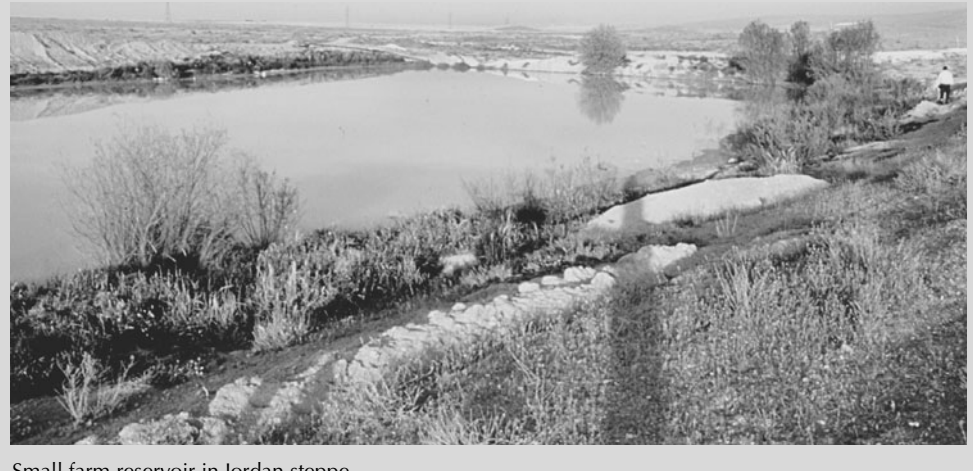
Small farm reservoir in Jordan steppe.

Large numbers of smaller-size reservoirs distributed over the catchment area have real advantages in water savings, social equity and environmental impact. The commonly practised method of delaying the use of water stored from winter to summer may not be the best strategy. To maximize the benefits, it is generally recommended that water be transferred from the reservoir and be stored in the soil as soon as possible. Storing reservoir water in the soil profile for direct use by crops in the winter season saves substantial evaporation losses that normally occur during the high evaporative demand period. Emptying the reservoir early in the winter provides more capacity for other run-off events. Furthermore, higher reservoir water use efficiency can be achieved by supplemental irrigation of winter crops over full irrigation of summer crops.