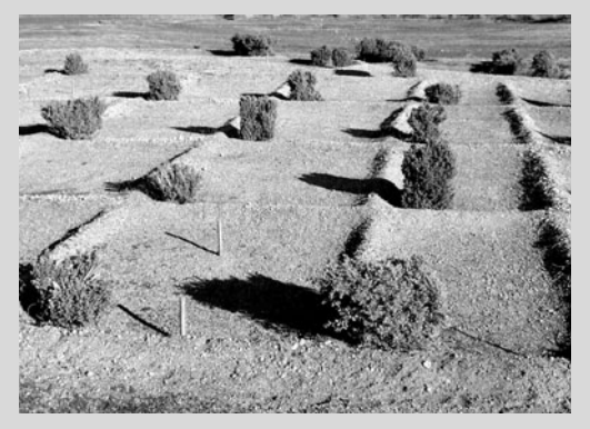
The negarim (small basin) water-harvesting system.

Trees planted survived the drought and grew satisfactorily over the seasons and are still producing after 23 years. Farmers adopted the technology in several areas of the dry zone. Although the intervention was very successful, there were some problems. The selection of deep soils and drought-tolerant species are so critical in this area. The soil should be deep enough to hold sufficient water to sustain the plant for the whole dry season. It is important that the crop is tolerant to drought so that the trees do not die after some years, even if drought occurs.