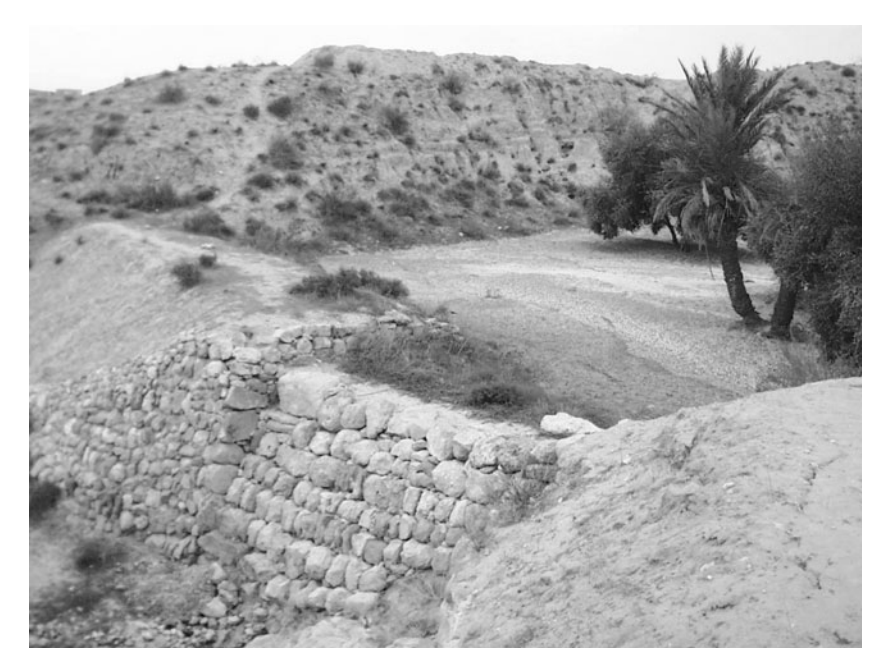
Fig. 9.3. Jessours are widely practised in Tunisia for water harvesting.