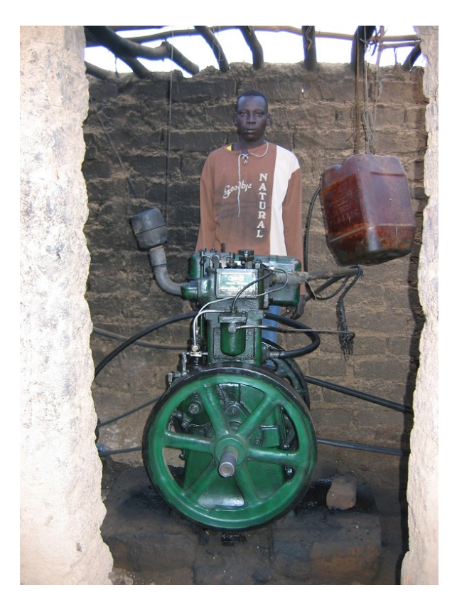
Figure 1: One of the owner's family with a diesel electricity generator in Wau Nur, Kassala. Kenya.

The internal combustion (IC) engine has been used for many decades in developing countries playing a very important role in providing power for rural communities. Many stand-alone units are used for milling, small-scale electricity production, water pumping, etc. They are readily available, off-the-shelf in most major towns and cities in a range of sizes to suit various applications. There is usually a well-established spare parts and maintenance network, both at urban and rural centres.