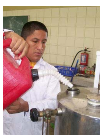
Figure 3: Making biodiesel in Peru.

In another project in South Africa they are testing the impact of the hydrology of growing Jatropha trees for oil production.