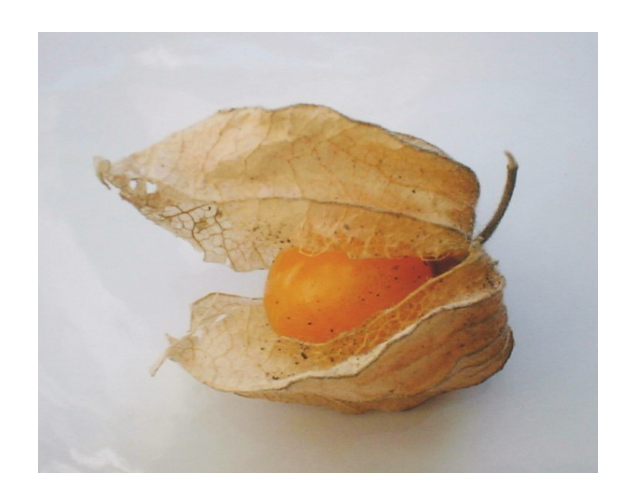
Calyx open, exposing the ripe fruit

Basic research on cape gooseberry and its constituents, such as polyphenols and/or carotenoids,