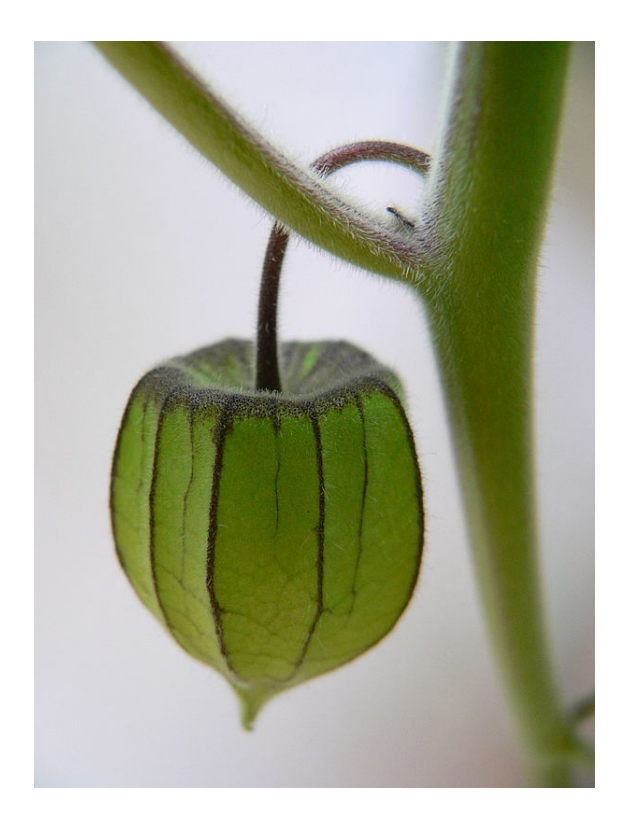
In green calyx

Physalis peruviana is closely related to the tomatillo, also a member of the genus Physalis . As a member of the plant family Solanaceae, it is more distantly related to a large number of edible plants, including tomato, eggplant, potato and other members of the nightshades.<sup>[4]</sup> Despite