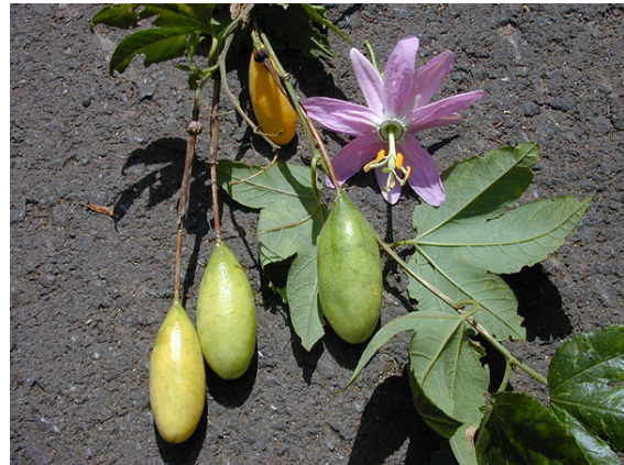
Close-up of fruit

Passiflora tarminiana is cultivated for its edible fruit. It is the second most common species in cultivation in South America after P. tripartita var. mollissima and is considered more disease resistant than that species. [1] The fruit are also eaten in New Zealand but in Hawaii the fruit is considered to be insipid.