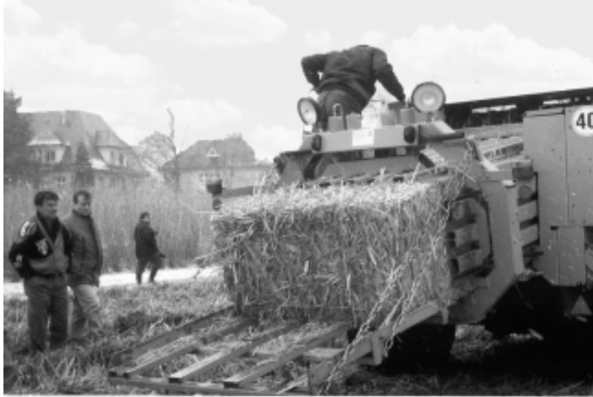
Figure 5. Baling of miscanthus straw from a demonstration plot, using a Claas baler. A color version of the image is on the Bioenergy Information Network website photo gallery ( http://www.esd.ornl.gov/bfdp/).