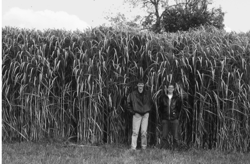
Figure 1. Mature stand of Miscanthus x giganteus . The taller man has a height of about 1.9 m, so the stand is approximately 3.5 m high. Photograph taken September 1996, about 30 km south of Ulm in southern Germany, by Dr. I. Lewandowski, University of Hohenheim. A color version of the image is on the Bioenergy Information Network website photo gallery ( http://www.esd.ornl.gov/bfdp/ ).