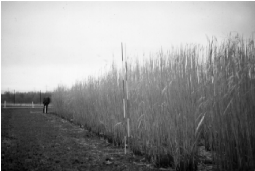
Figure 2. Demonstration plot of Miscanthus x giganteus pictured just before harvest. Scale divisions on range poles are 0.5 m, so stand is about 2.5 m tall. Photograph taken February 1995, Forchheim, Baden-Württemberg, southern Germany, by Dr. I. Lewandowski, Institute for Crop Production and Grassland Research, University of Hohenheim, Germany. Reproduced by permission. A color version of the image is on the Bioenergy Information Network website photo gallery ( http://www.esd.ornl.gov/bfdp/ ).