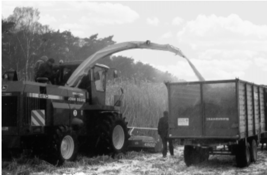
Figure 4 . Harvesting of demonstration plot of Miscanthus x giganteus using a Kemper Champion 4500 forage harvester mounted on a John Deere combine. The harvester is modified with hardened cutting blades to withstand the extra wear due to the relatively high silicon content of miscanthus biomass. Photograph taken February 1995, Forchheim, Baden-Württemberg, southern Germany, by Dr. I. Lewandowski, Institute for Crop Production and Grassland Research, University of Hohenheim, Germany. Reproduced by permission. A color version of the image is on the Bioenergy Information Network website photo gallery ( http://www.esd.ornl.gov/bfdp/ ).

To harvest the miscanthus crop, a chopping forage harvester may be used ( Kemper Champion 3000 ), although a row-independent device is needed on older stands where the original planting pattern has become indistinct (Fig. 4). Such harvesting trials have used a chopped length from 11 mm to 44 mm. Baling and bundling are both possible (Fig. 5), but field losses (10% or more due to baling) and stem size/stiffness (bundling) need to be taken into account (Huisman et al. 1996; Venturi and Huisman 1997).